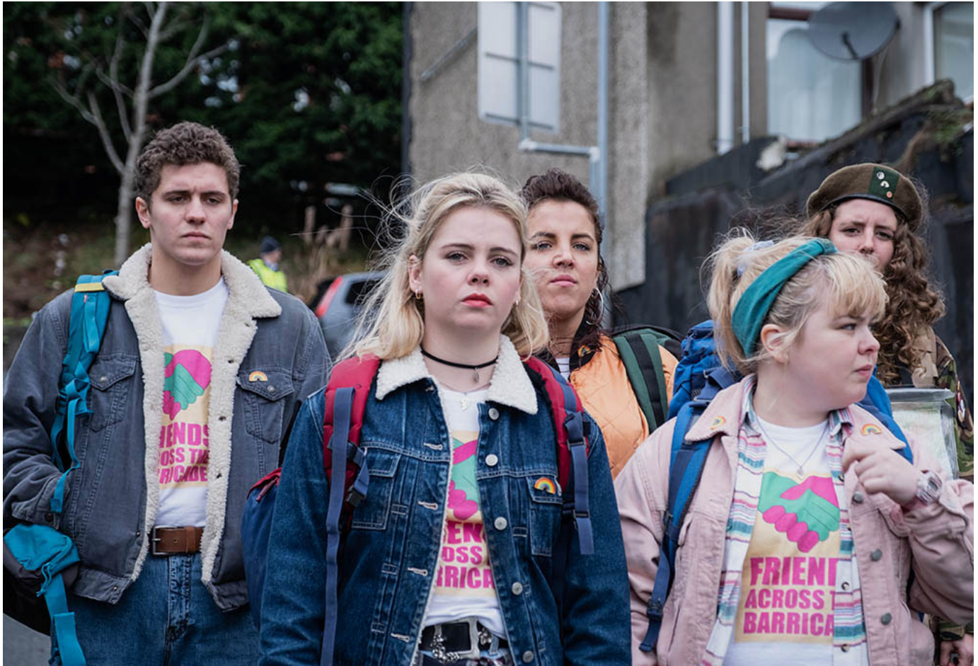
From left: Dylan Llewellyn as James, Saoirse-Monica Jackson as Erin, Jamie-Lee O'Donnell as Michelle, Nicola Coughlan as Clare, and Louisa Harland as Orla in "Derry Girls"