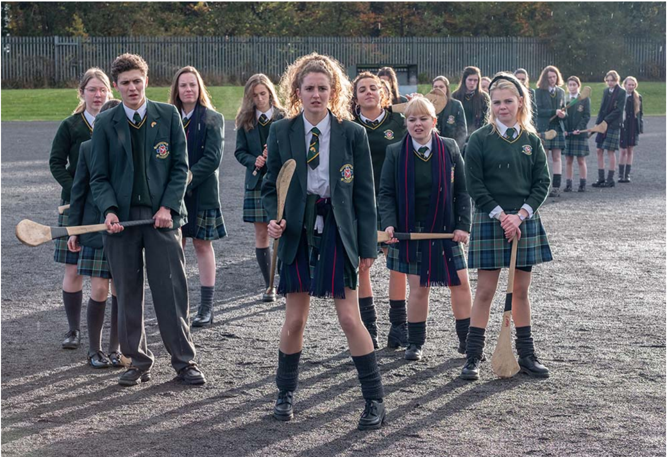
The cast of "Derry Girls" in Season Two

Father Peter's attempt to boil it all down to "We all feel, love, dream" only confuses the group. In the end, the kids find their own common ground: parents.