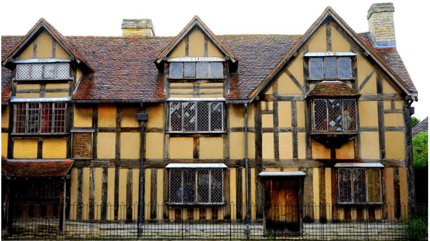
Childhood home of William Shakespeare in Stratford-upon-Avon, England

Even the book's cover art underscores that theme with a stained-glass window depicting Joseph of Arimathea planting his staff in England. The title references Frederick William Faber's iconic hymn .