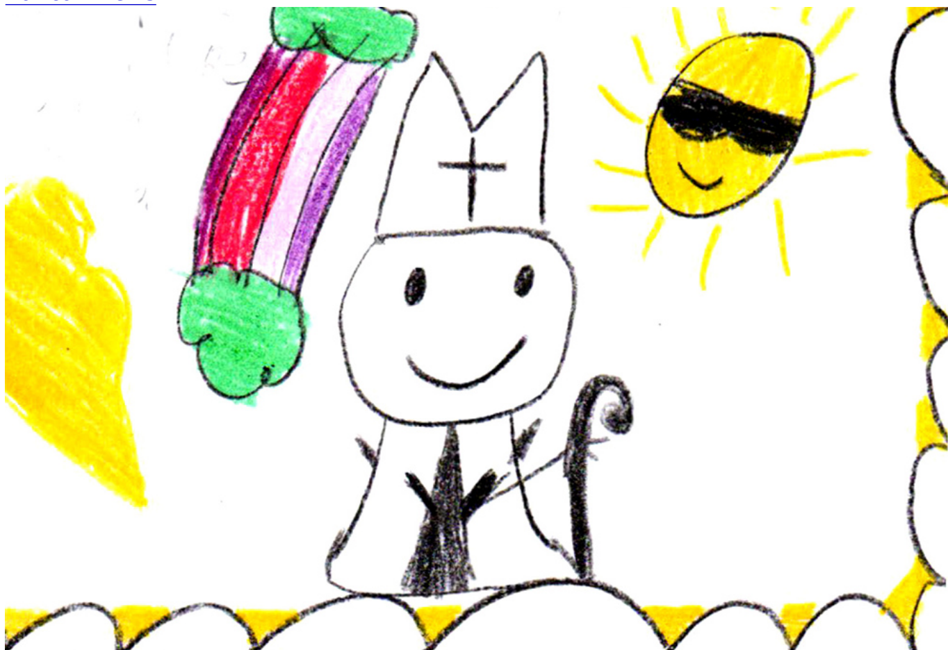
Artwork from a letter by a Robb Elementary student who wrote to Pope Francis