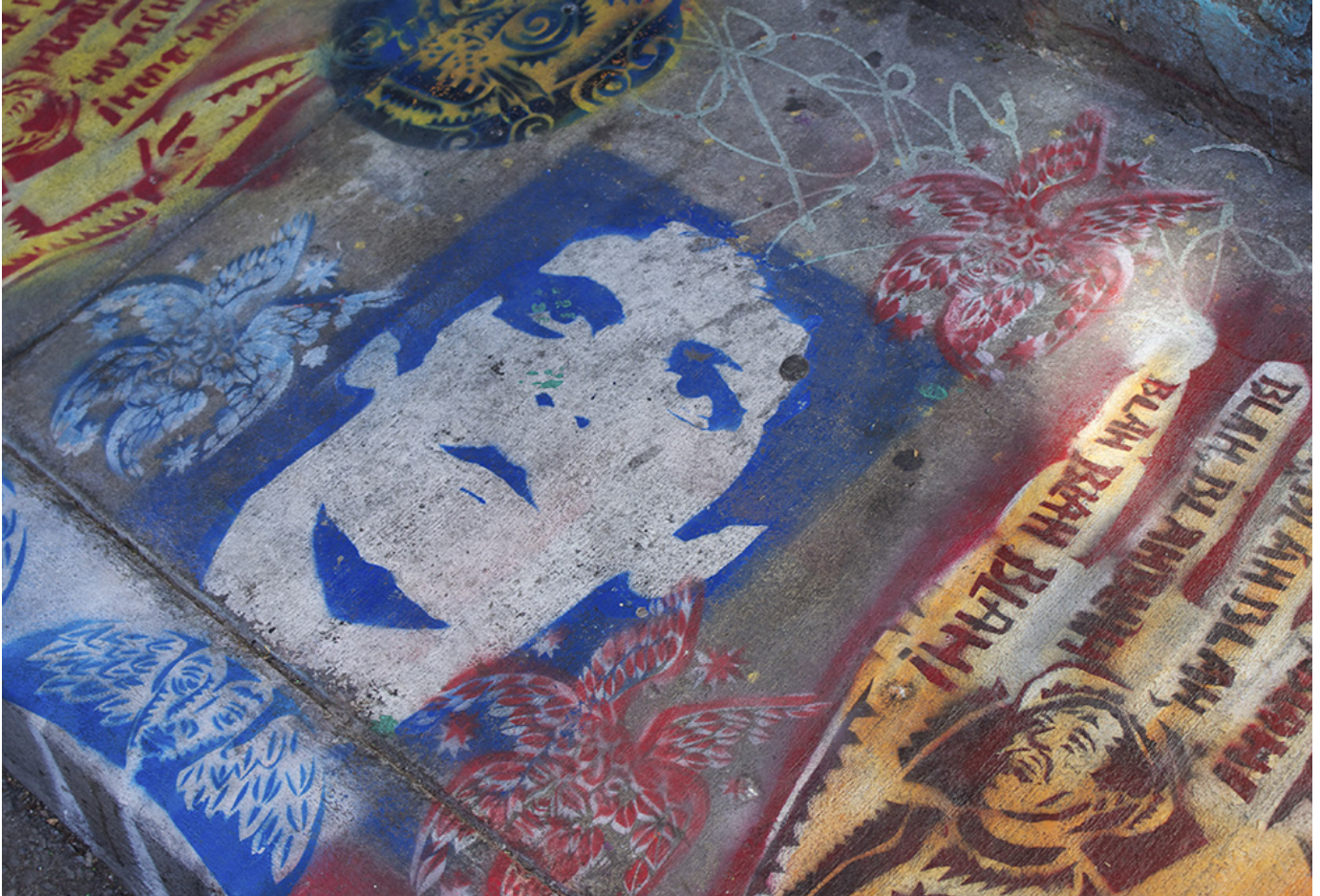
Street art with Lou Reed