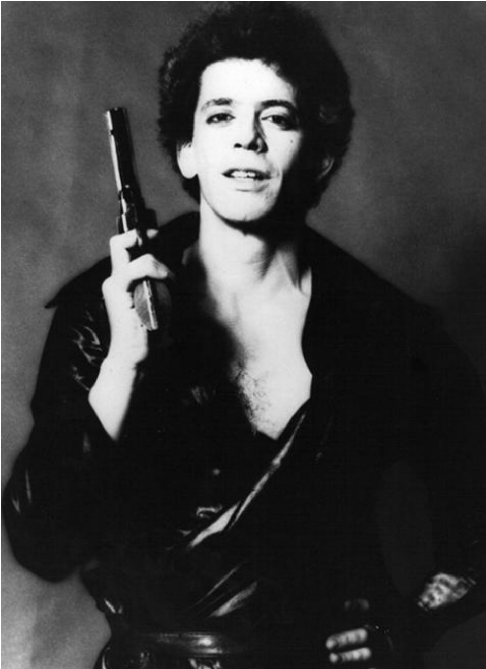
Lou Reed in 1977

New York had become queer wild after World War II. Returning queer soldiers moved to coastal cities, places big enough where you could disappear into the seams of society, and hope to find some other people who could see in you what they saw in