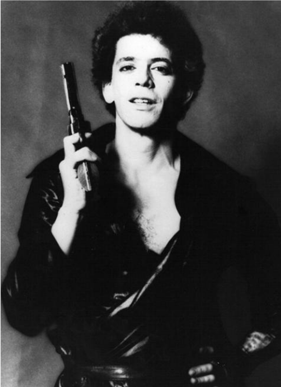
Lou Reed in 1977

New York had become queer wild after World War II. Returning queer soldiers moved to coastal cities, places big enough where you could disappear into the seams of society, and hope to find some other people who could see in you what they saw in