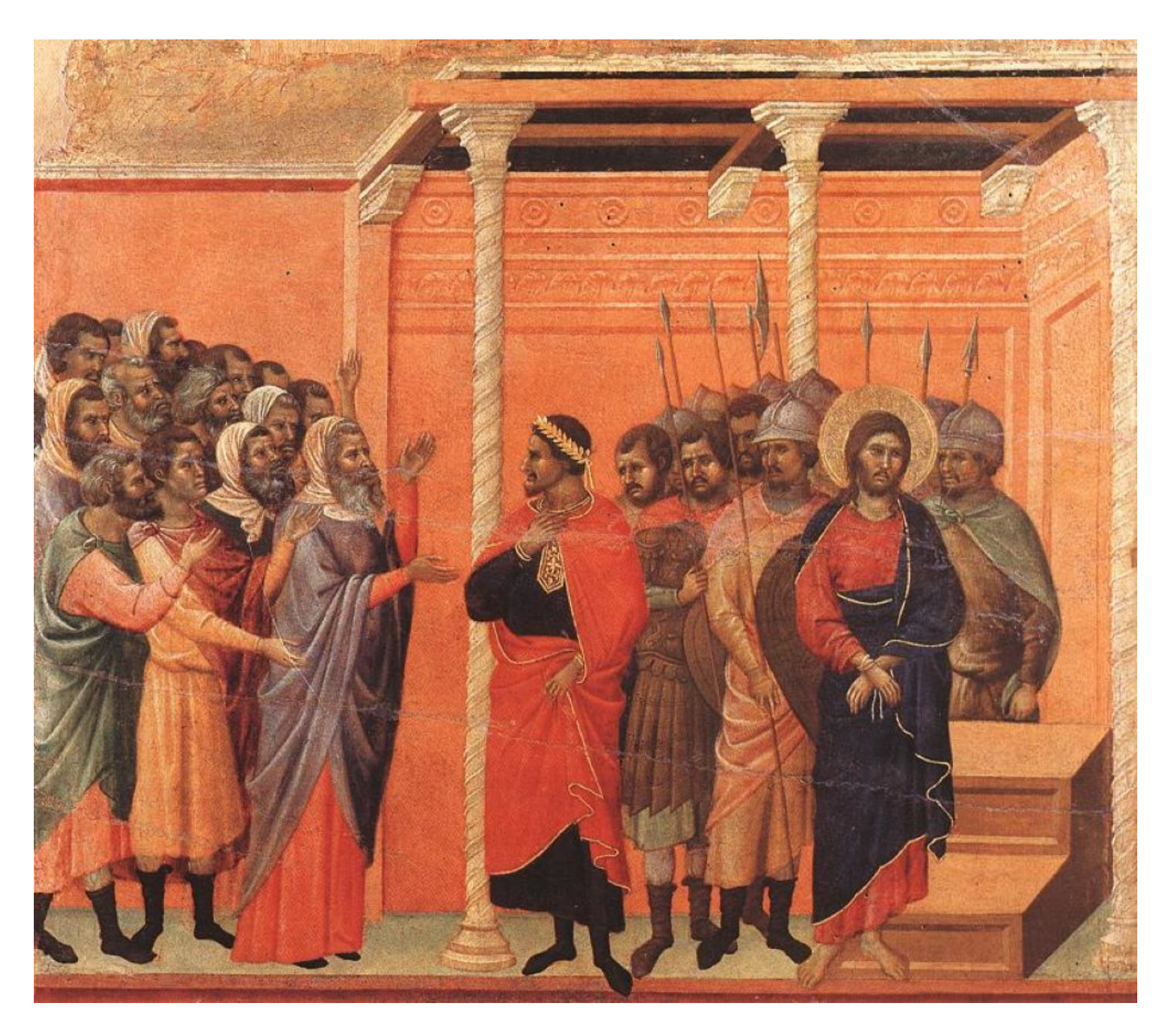
"Christ Accused by the Pharisees" by Duccio di Buoninsegna, circa 1308

As the demographic balance of the early church shifted from Jews to gentiles, the evangelists, writing exclusively or predominantly for non-Jews, could repurpose these intramural disputes in the service of a generalized portrait of Jewish badness, a polemic that reaches its apogee in John's Gospel, where Pharisees — now virtually interchangeable with "the Jews" — exemplify the cosmic darkness over against which the illumination of the incarnate Word is juxtaposed.