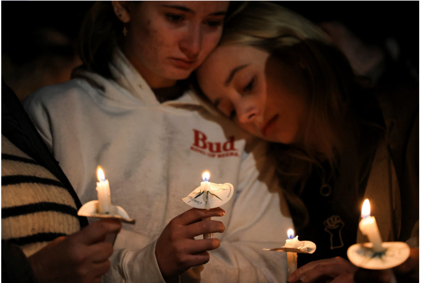
People in Colorado Springs, Colorado, attend a Nov. 20 vigil after a mass shooting Nov. 19 at Club Q, an LGBTQ nightclub.