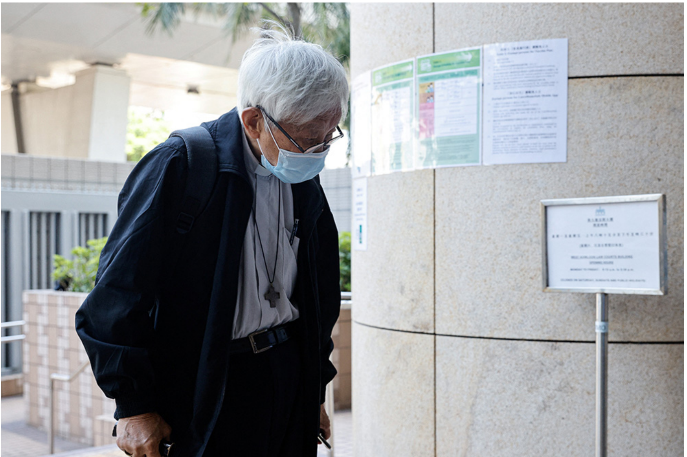
Cardinal Joseph Zen Ze-kiun, retired bishop of Hong Kong, arrives at the West Kowloon Magistrates' Courts in Hong Kong Sept. 26.

From his prison cell, he serves as a symbol of truth for the faithful and for all who share his commitment to preserving freedom around the globe. Soon, Zen may suffer the same fate.