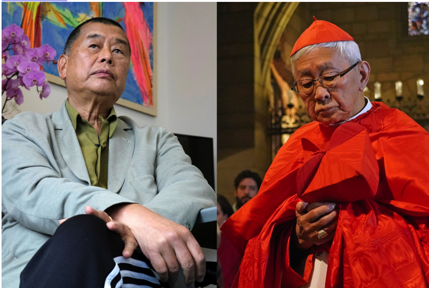
Catholic media tycoon and philanthropist Jimmy Lai in May 2020 ; right: Cardinal Joseph Zen Ze-kiun, retired bishop of Hong Kong, in February 2020