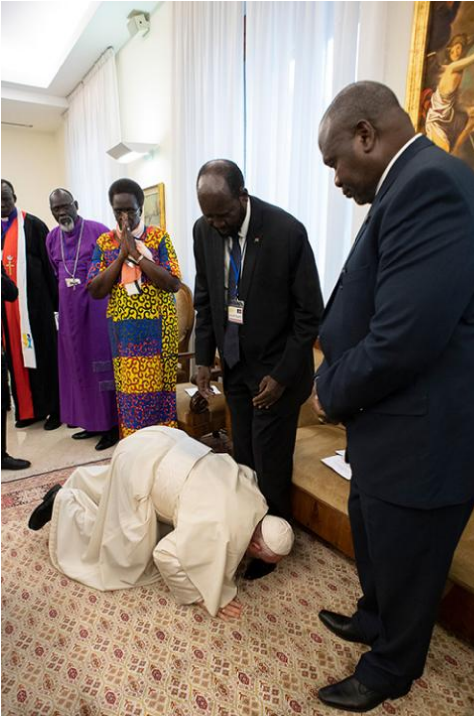
Pope Francis kisses the feet of South Sudan President Salva Kiir April 11, 2019, at the conclusion of a two-day retreat at the Vatican for African nation's political leaders.