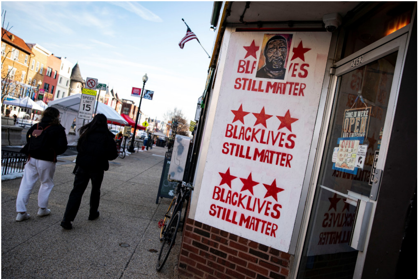
People in Washington walk past a sign about the Black Lives Matter movement Feb. 21, 2021.

The authors suggest that we are all responsible for minding and mining our words to engender how we delight in the Lord.