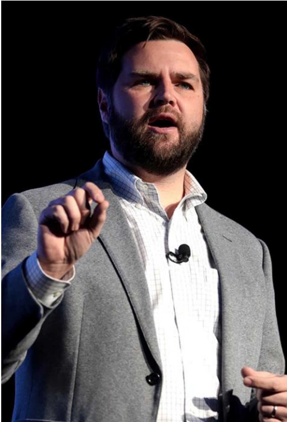
J.D. Vance speaks at the 2021 Southwest Regional Conference hosted by Turning Point USA at the Arizona Biltmore in Phoenix.