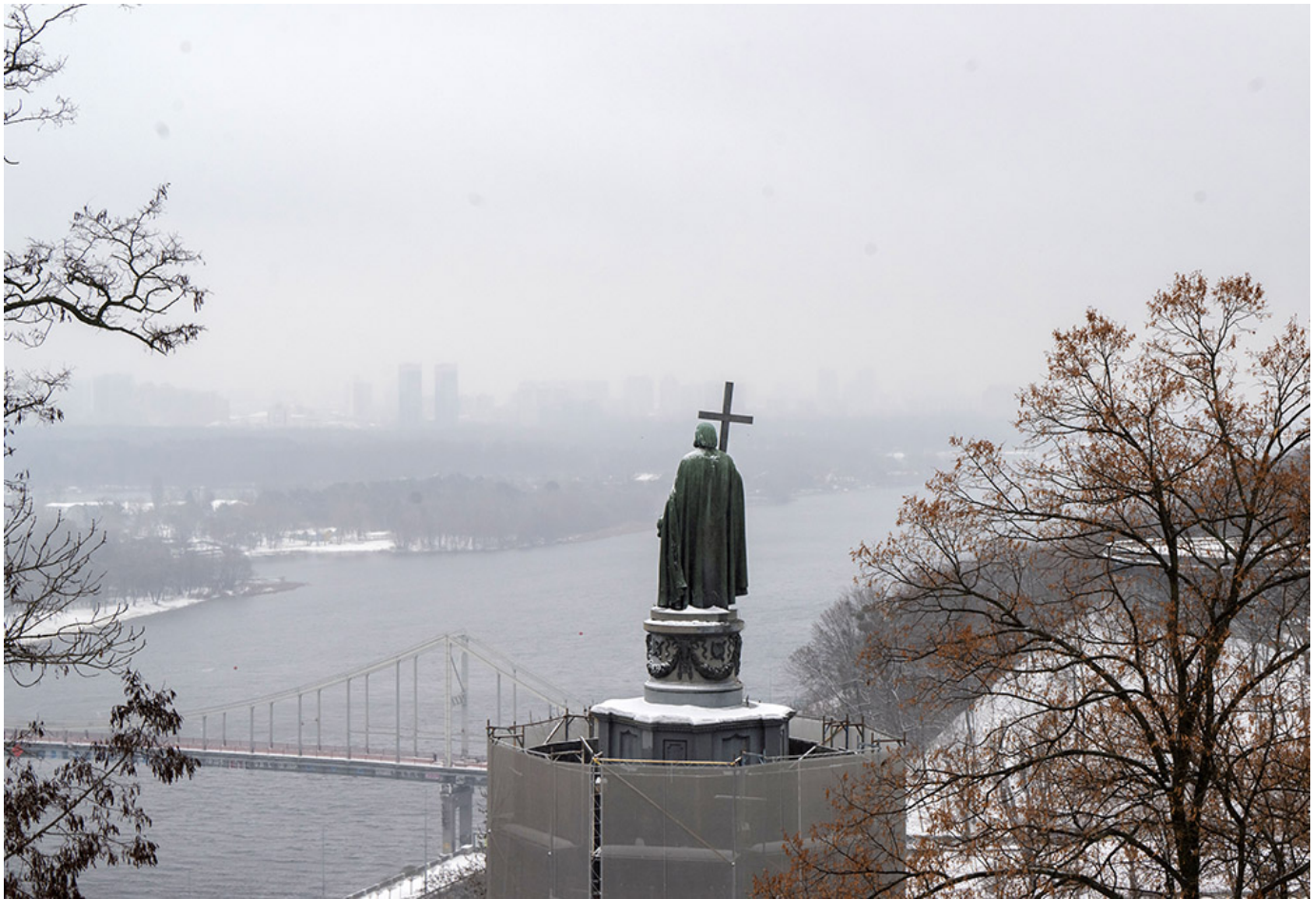
A statue of Vladimir the Great overlooks Dnipro River in Kyiv, Ukraine, on Dec. 7.

"At a parish, a little old lady approached me to say, 'We live in constant terror, we are afraid, it is good that you talk to us,' " he recounted to the journalists who visited him at his cathedral Dec. 9.