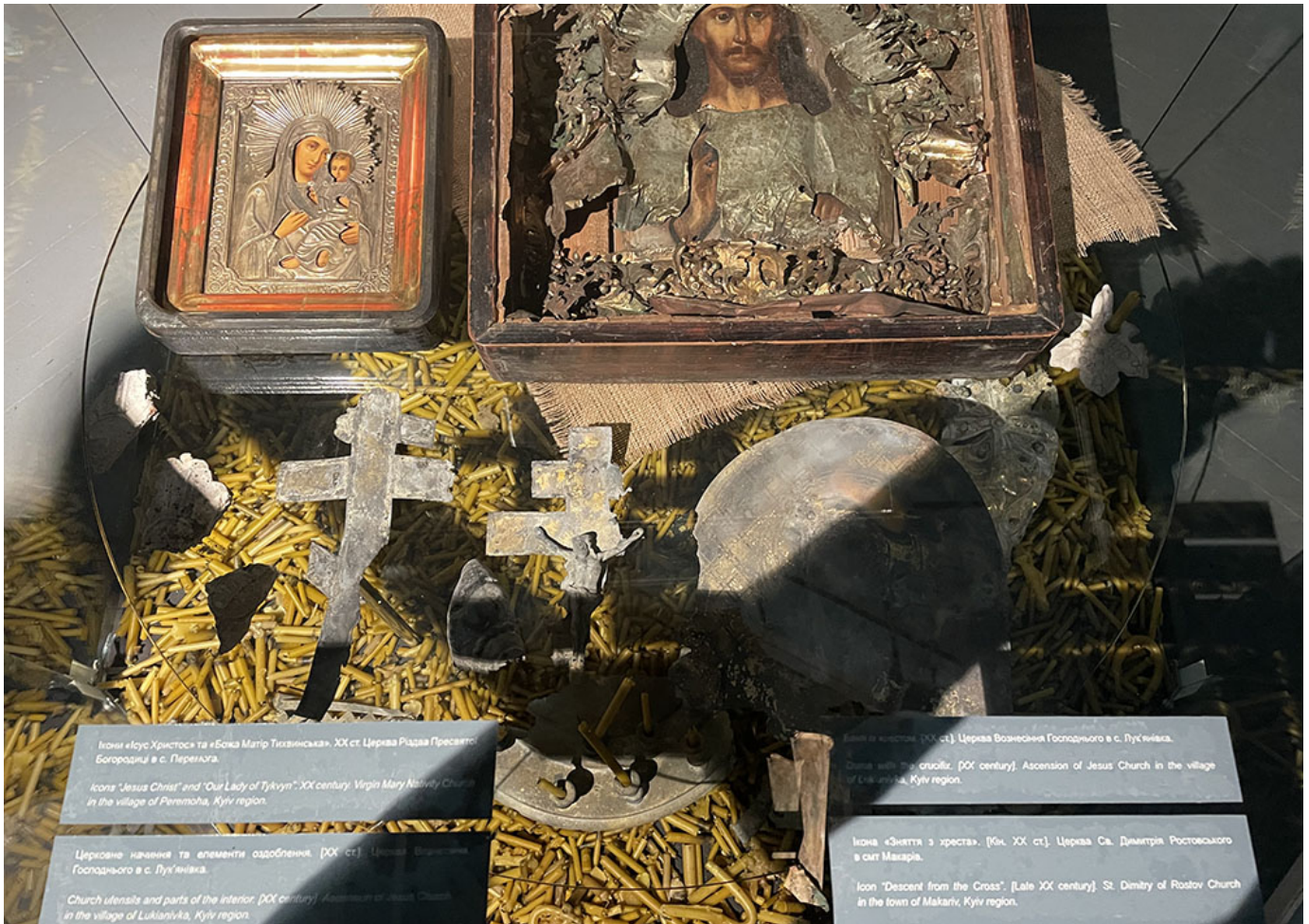
Damaged icons and crucifixes sit atop Russian bullets at the "Ukraine Crucifixion" exhibit in Kyiv, Ukraine, on Dec. 8.

And be it in neighboring Poland — where 8 million Ukrainian refugees and displaced persons have crossed into since the war's outbreak — or among those who remain in Ukraine, there is widely shared determination, often spoken of with religious conviction, that however long is necessary, the country is willing to continue battling Russia to defend its territorial integrity.