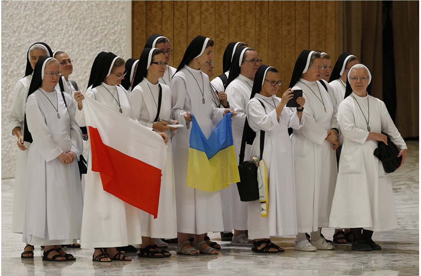
Nuns hold the national flags of Poland and Ukraine as they prepare to greet Pope Francis during his general audience in the Paul VI hall at the Vatican Aug. 3, 2022.

With the ending of COVID-related travel restrictions, it is again possible to visit college campuses, and every time I do, someone will approach me to complain about the culture of intellectual conformity and mediocrity on campus. Sometimes it is a student, sometimes a teacher, but the refrain is the same: Our Catholic intellectual tradition is being shunted aside. More on this in the weeks ahead.