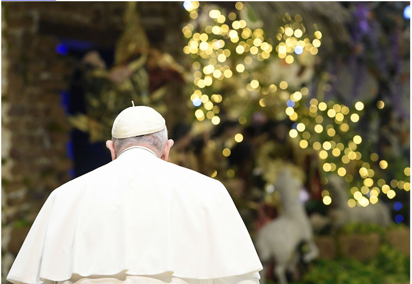
Pope Francis in the Paul VI hall at the Vatican Dec. 3, 2022