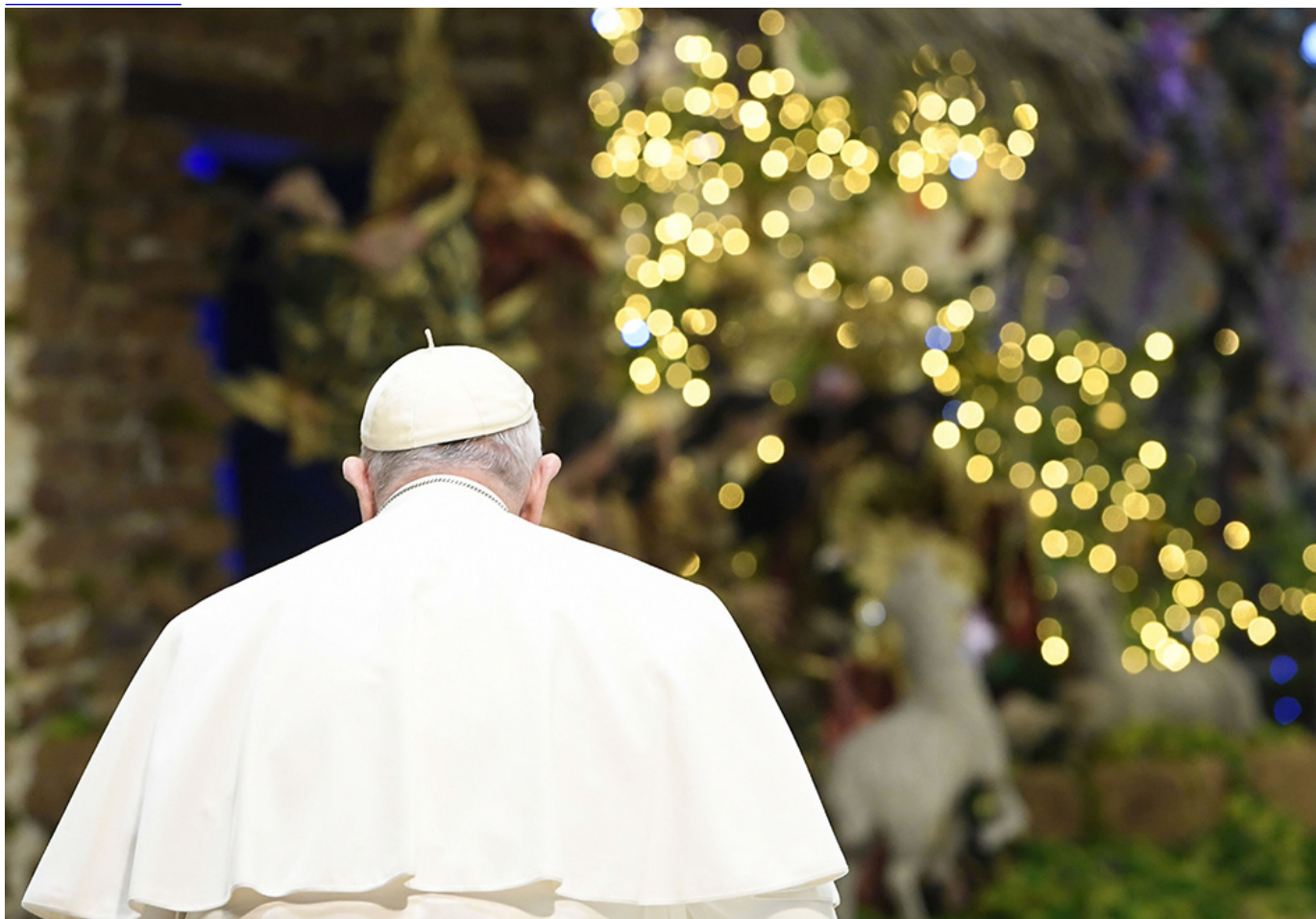
Pope Francis in the Paul VI hall at the Vatican Dec. 3, 2022