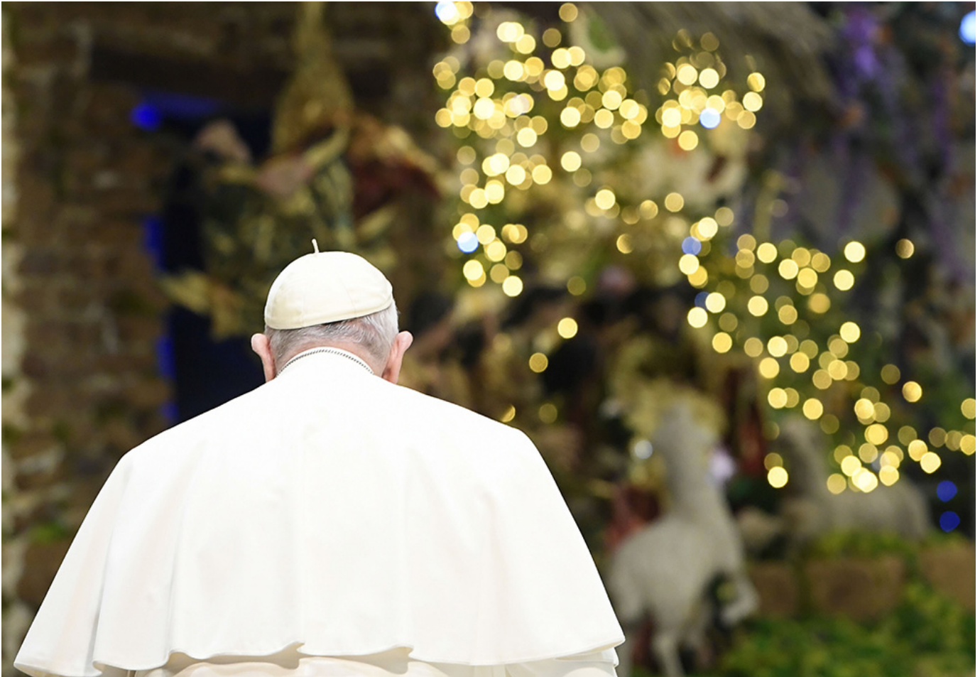
Pope Francis in the Paul VI hall at the Vatican Dec. 3, 2022