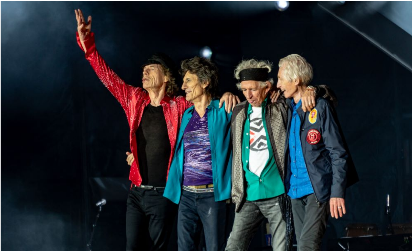
The Rolling Stones, (from left) Mick Jagger, Ronnie Wood, Keith Richards and Charlie Watts, bow post-show in London 2018.

Isn't all art? (A reflection of the moment)