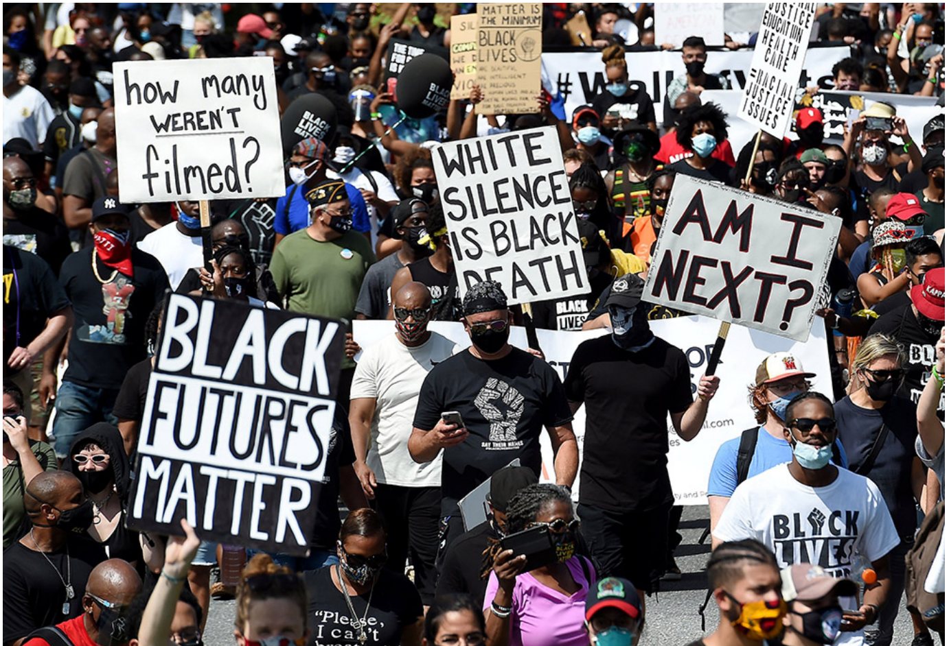
People hold placards in Washington Aug. 28, 2020, during the "Get Your Knee Off Our Necks" Commitment March on Washington 2020 in support of racial justice.

I recently completed a class on "The Distinctive Gifts of Black Catholic Spirituality" at Loyola Marymount University. I was struck by two realities. First, the participants' collective experience with racism and racial indifference in their parishes and dioceses, and second, their continued commitment to remain Catholic. Some consider it a miracle that any Black person is faithful to a church with historical and continued racial indifference, ignorance, and, at times, hostility. The writer of the letter to James told us two millennia ago, "these things ought not to be so" ( James 3:10 ).