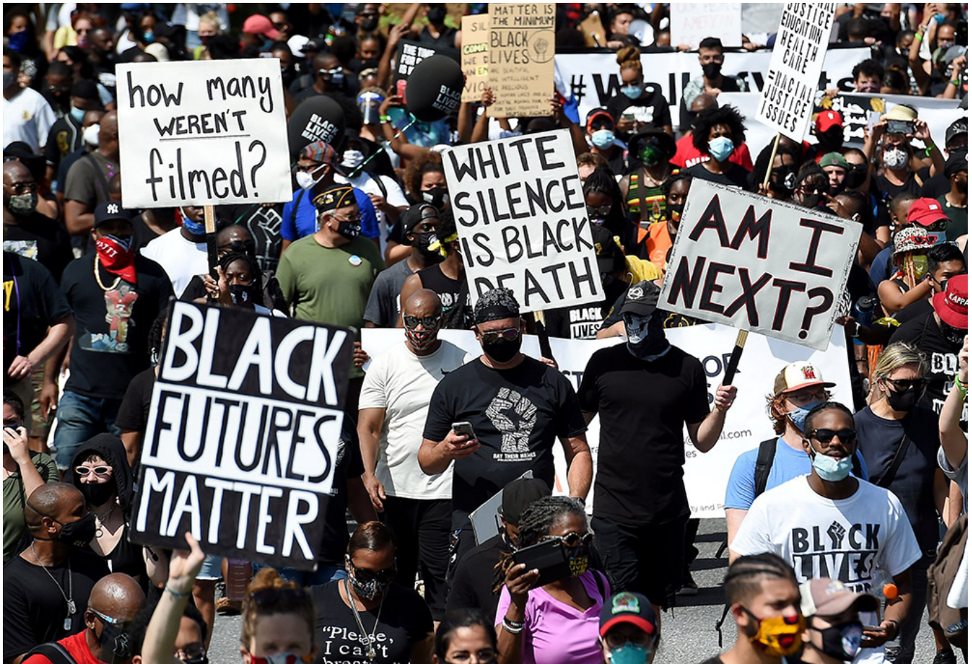
People hold placards in Washington Aug. 28, 2020, during the "Get Your Knee Off Our Necks" Commitment March on Washington 2020 in support of racial justice.

I recently completed a class on "The Distinctive Gifts of Black Catholic Spirituality" at Loyola Marymount University. I was struck by two realities. First, the participants' collective experience with racism and racial indifference in their parishes and dioceses, and second, their continued commitment to remain Catholic. Some consider it a miracle that any Black person is faithful to a church with historical and continued racial indifference, ignorance, and, at times, hostility. The writer of the letter to James told us two millennia ago, "these things ought not to be so" ( James 3:10 ).