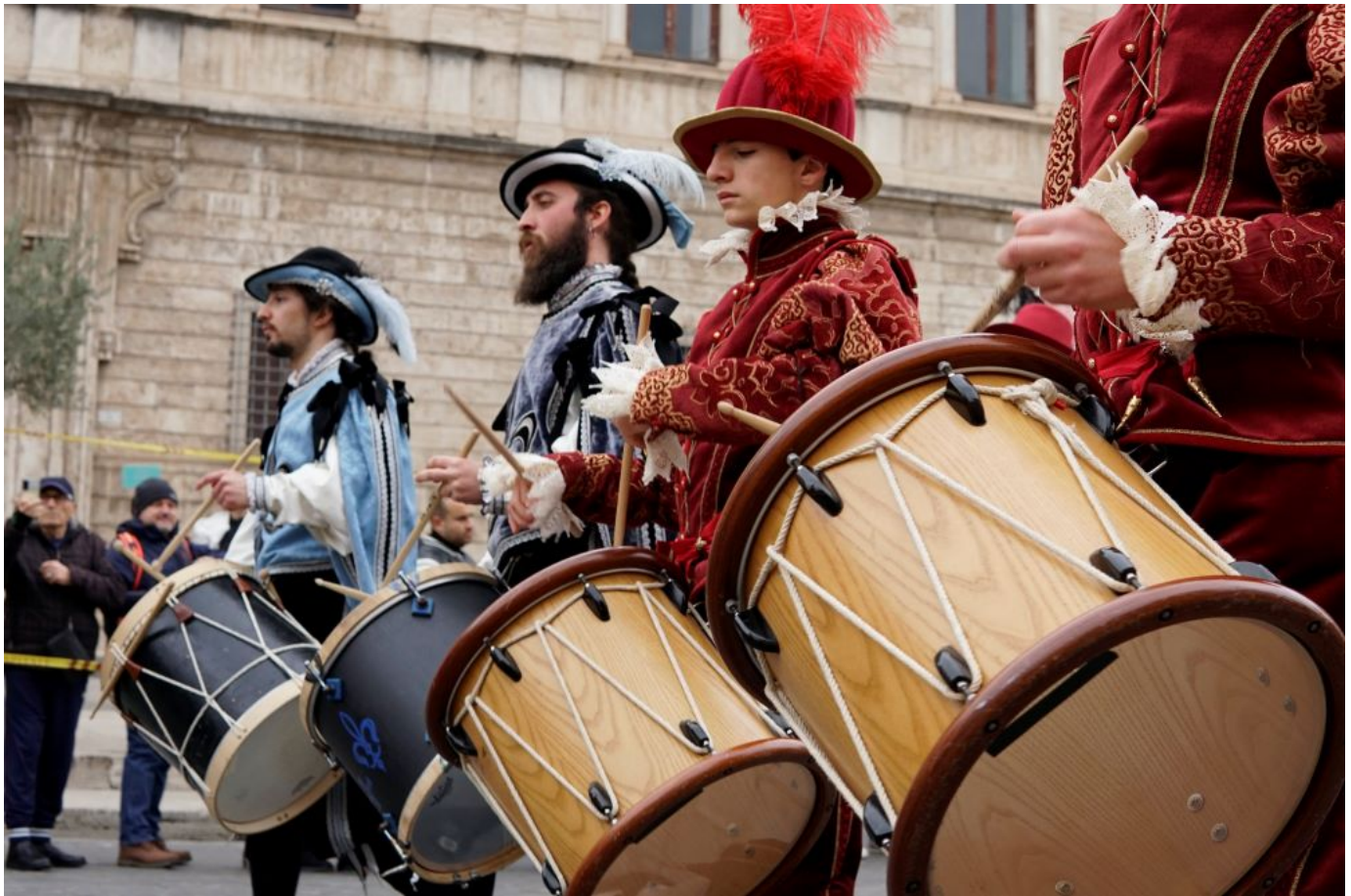
Drummers participate in a parade marking the feast of the Epiphany in Rome near the Vatican Jan. 6.