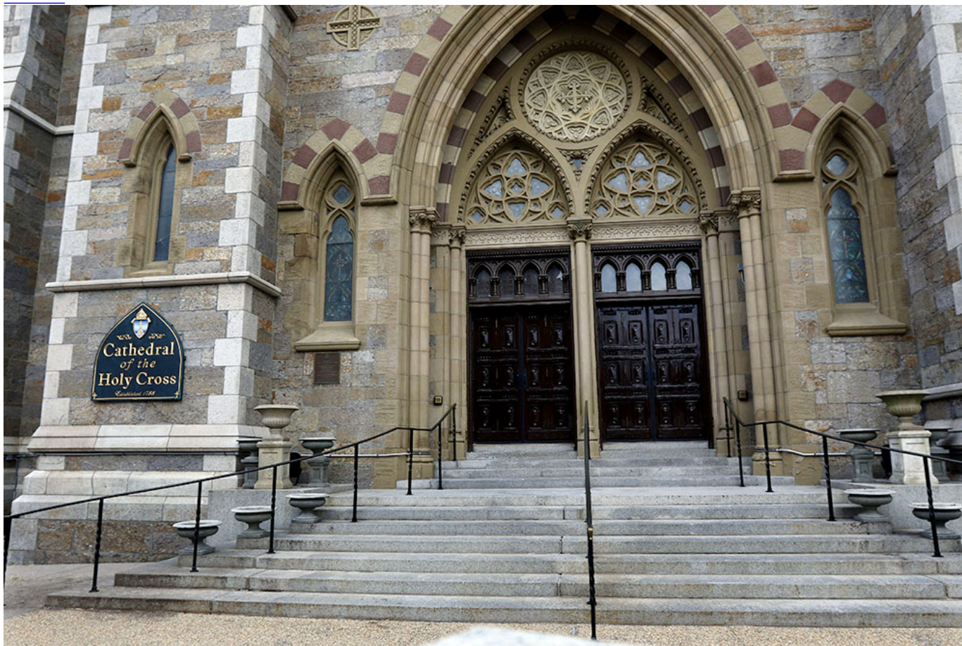
The Cathedral of the Holy Cross in the Boston Archdiocese