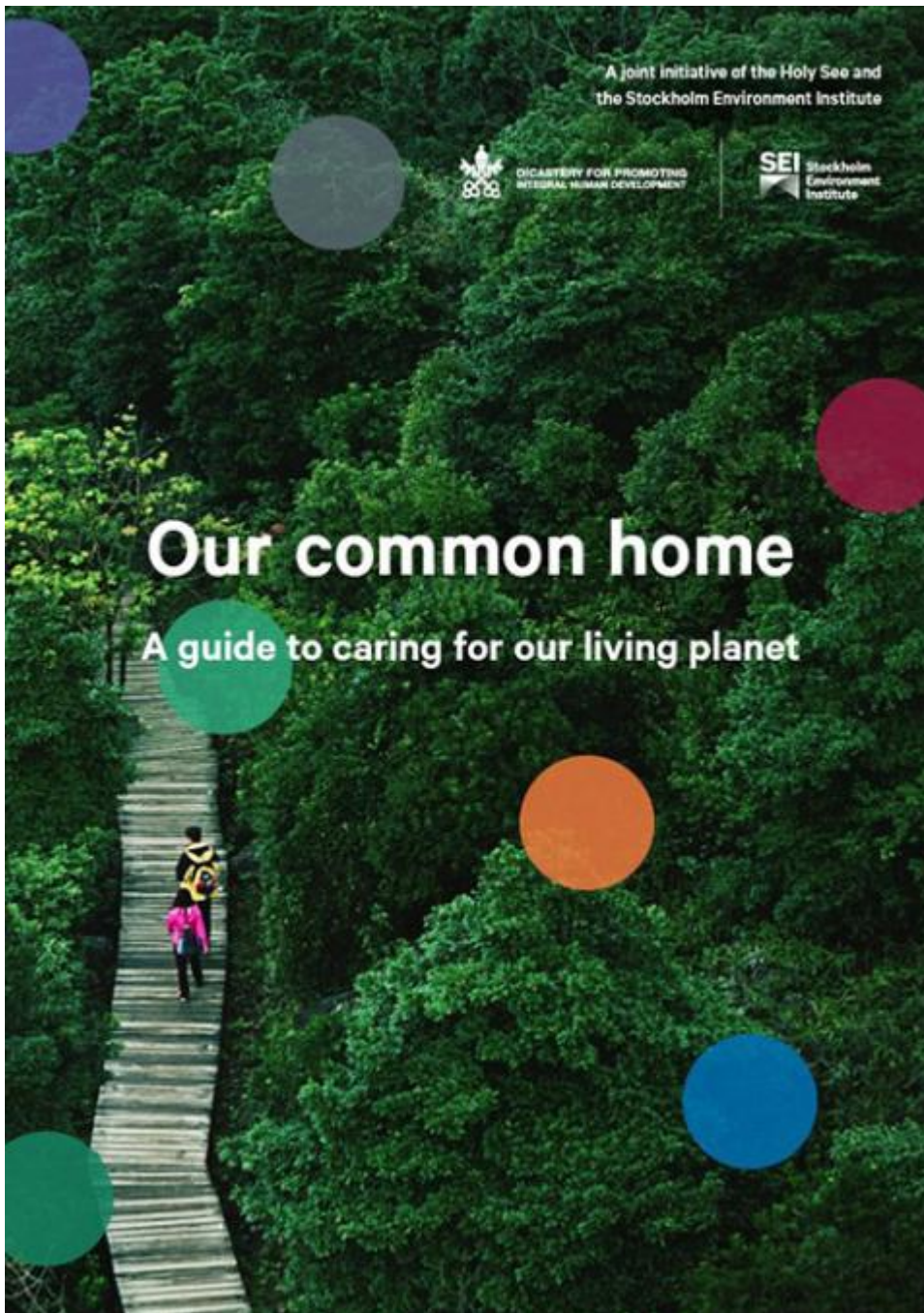
The cover of "Our Common Home: A Guide to Caring for Our Living Planet"

brief descriptions of what is required to address the problem and suggested reflections and action steps for people to take.