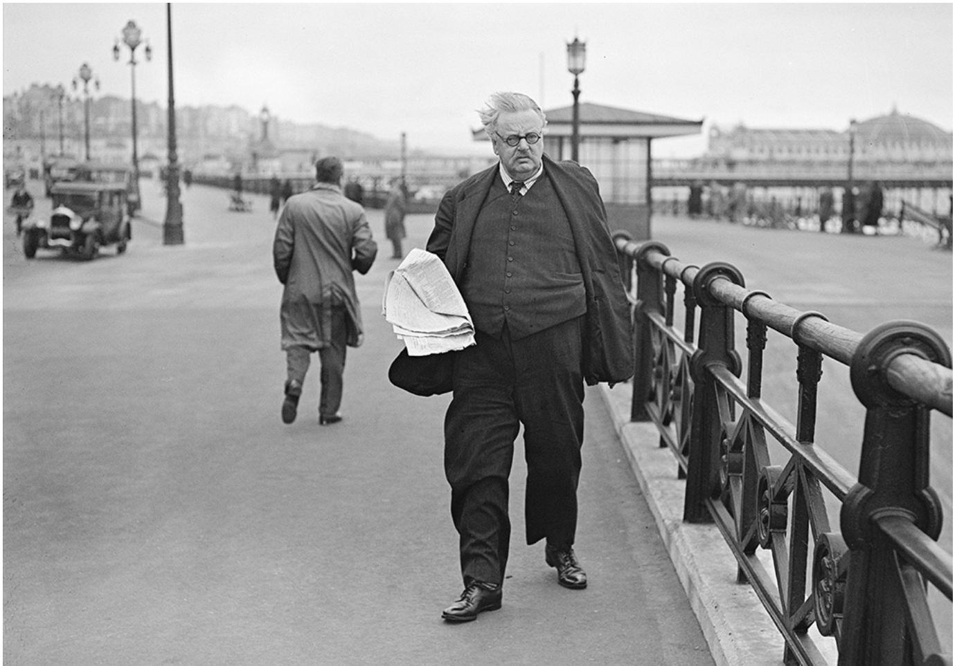
G.K. Chesterton takes a stroll in Brighton, England, on Oct. 30, 1935.