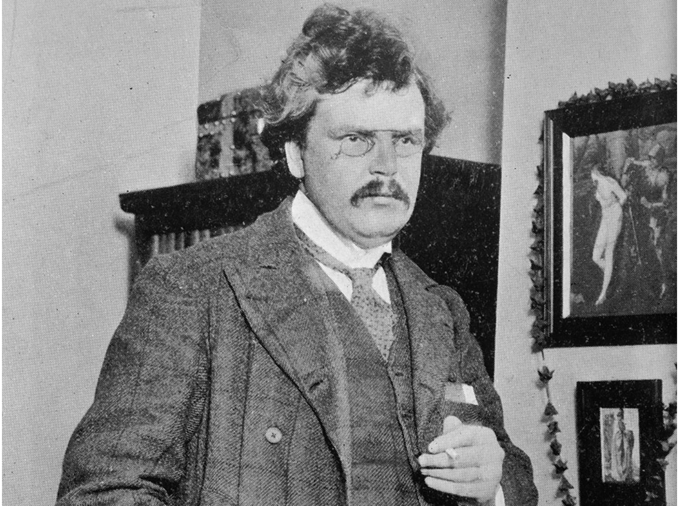
Catholic author G.K. Chesterton in an undated photo