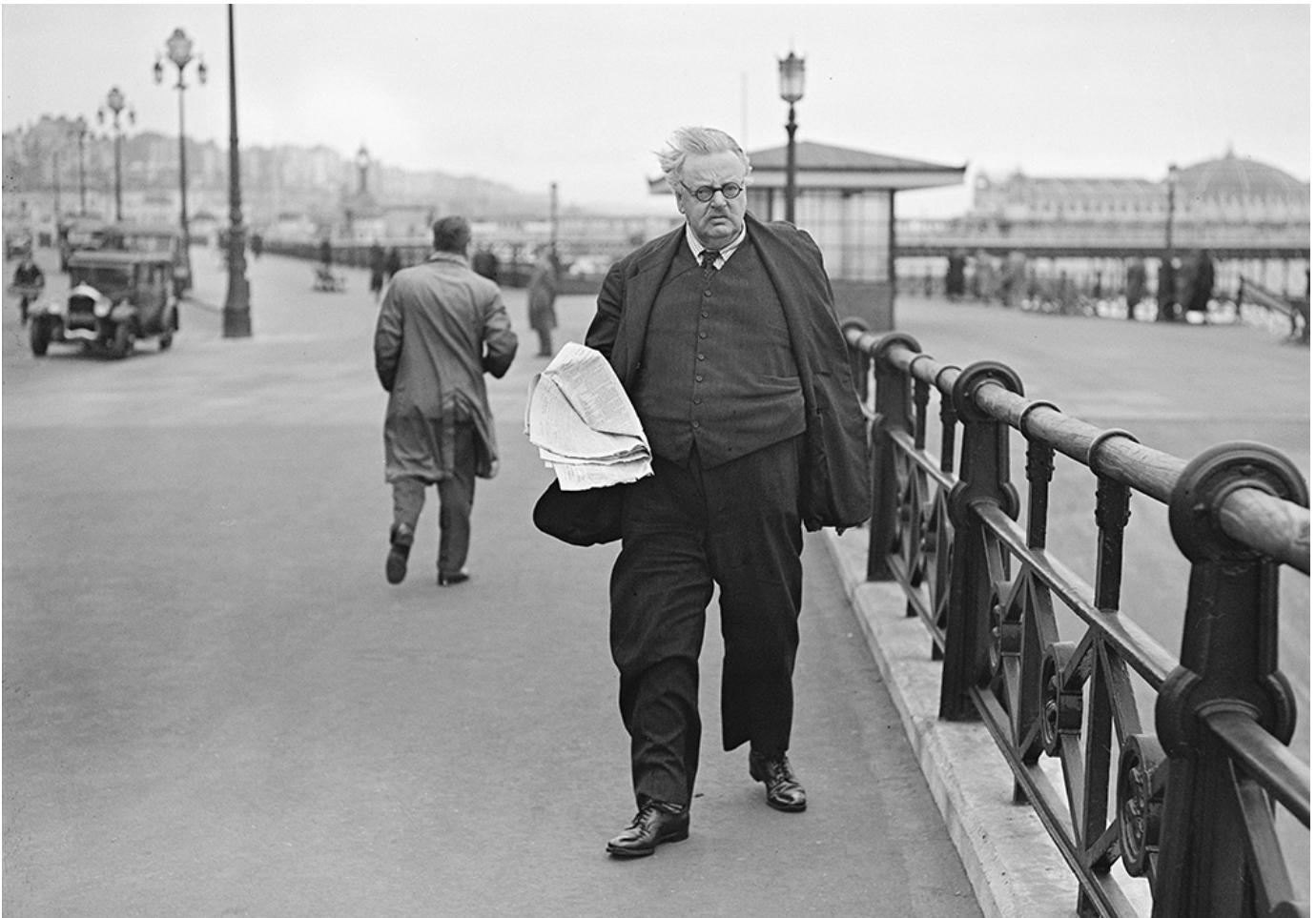
G.K. Chesterton takes a stroll in Brighton, England, on Oct. 30, 1935.