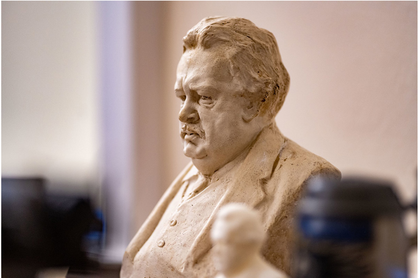
A bust of G.K. Chesterton is seen in the Chesterton Archive in London.

"Our Society, as a private association of the Christian faithful, remains hopeful that this will happen soon, and continues to work toward that end!" the society spokesperson told NCR.