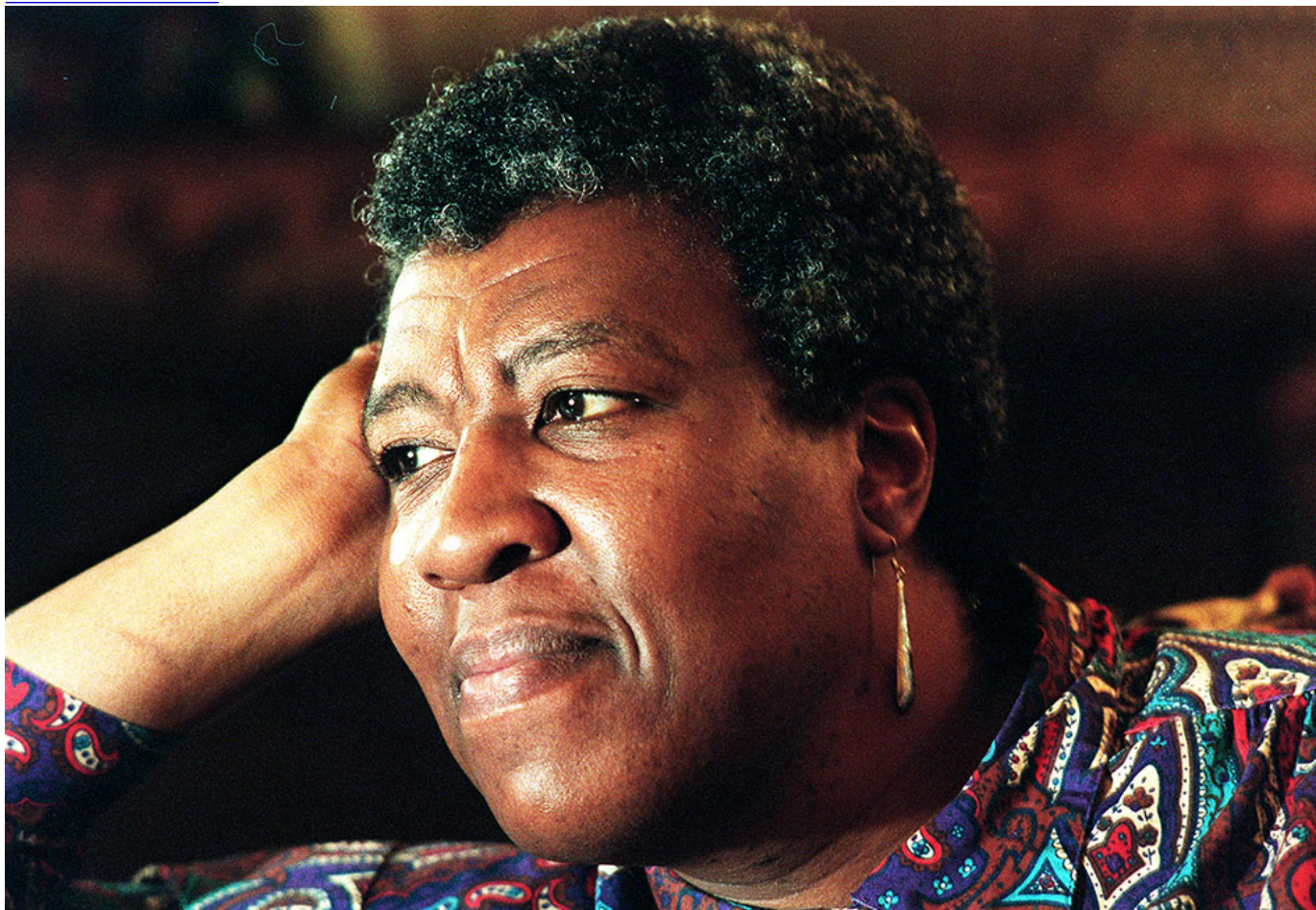
Science fiction author Octavia Butler in 1998