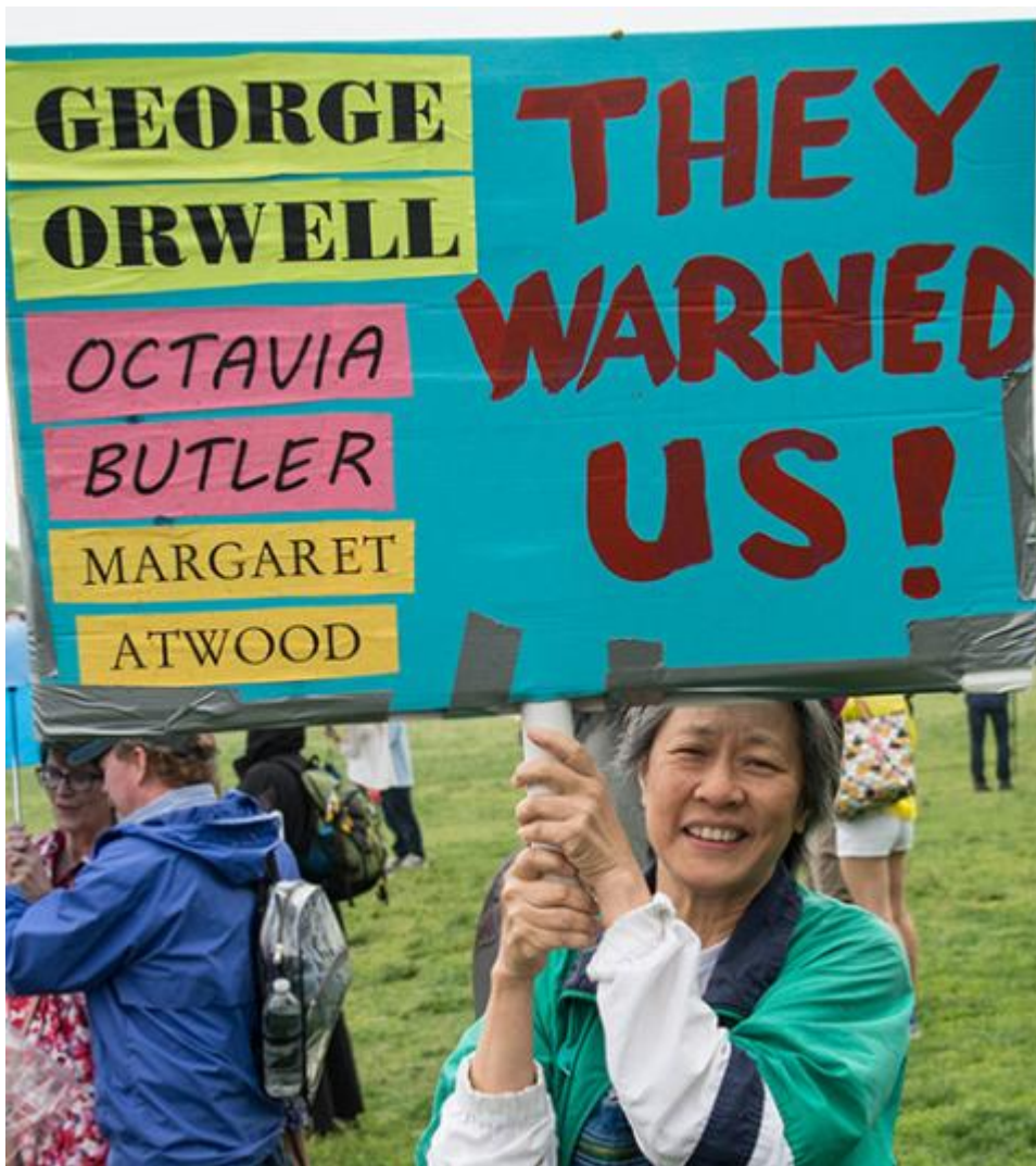
Sign at the March for Science 2017 in Washington, D.C.

earthly and the otherworldly, the human and supernatural, empathy and dread.