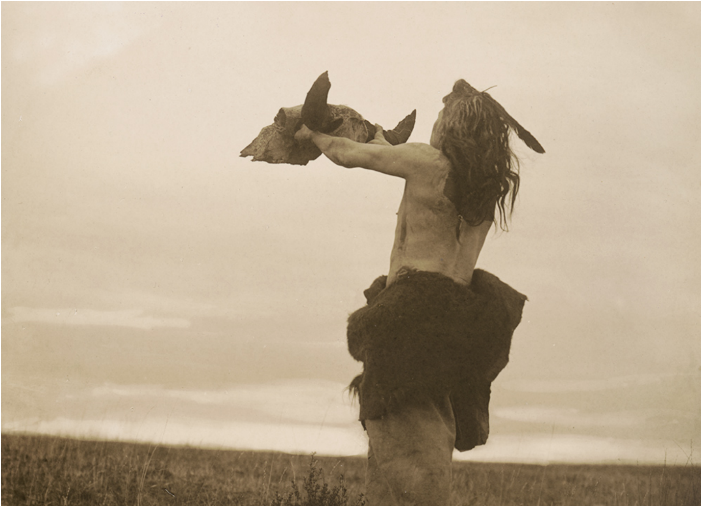
"Offering the Buffalo Skull," a photo of a Mandan Indian man, circa 1908