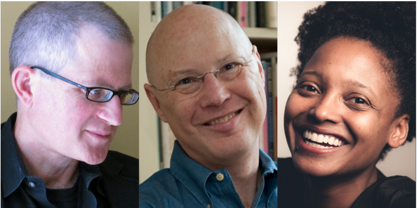
From left: Christian Wiman ; Andrew Hudgins ; Tracy K. Smith

Christian Wiman 's (1966) "Prologue" admits his own struggle with powerful humility: "I need a space for unbelief to breathe. / I need a form for failure, since it is what I have."