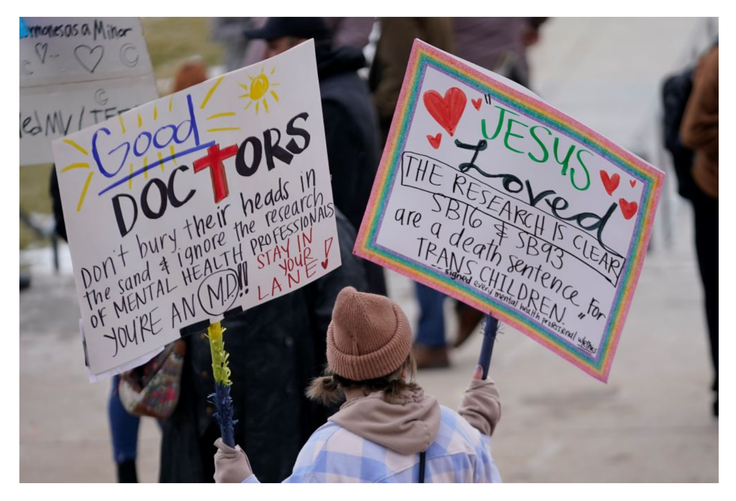
People gather in support of transgender youth during a rally at the Utah State Capitol Jan. 24, 2023, in Salt Lake City.

The gender binary I had long considered a way of categorizing all living beings was, I realized, more like a general taxonomical marker signaling a fluctuating set of characteristics on one side of a scale. As a kind of organizational shorthand, it is useful. But this does not mean that "male" and "female" are fixed and immutable metaphysical categories, or even fixed and immutable natural categories. What people refer to today as "gender ideology" is closer to accurately reflecting reality than the traditional binary view I grew up with.