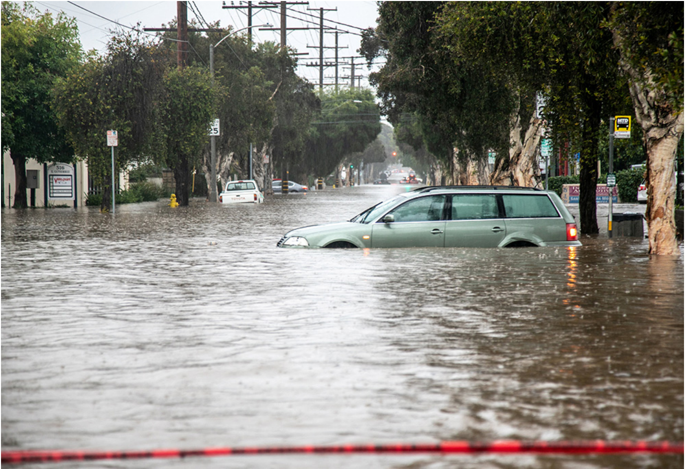
Abandoned cars are seen in a flooded street Jan. 9 in east Santa Barbara, California.