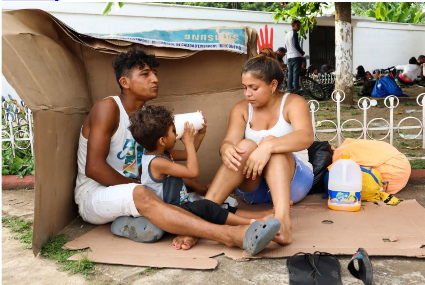
A migrant family in Huehuetán, Mexico, rests at a park with other caravan migrants heading to the U.S. border Nov. 18, 2021.