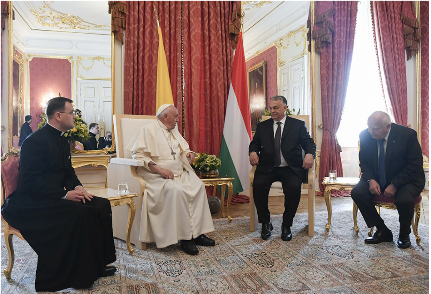
Pope Francis meets with Hungarian Prime Minister Viktor Orbán at Sándor Palace April 28 in Budapest, Hungary.