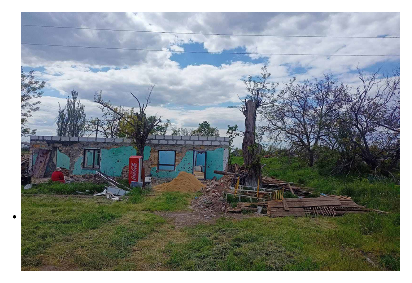
Destroyed property in the wake of the Russian invasion near Mykolaiv, eastern Ukraine