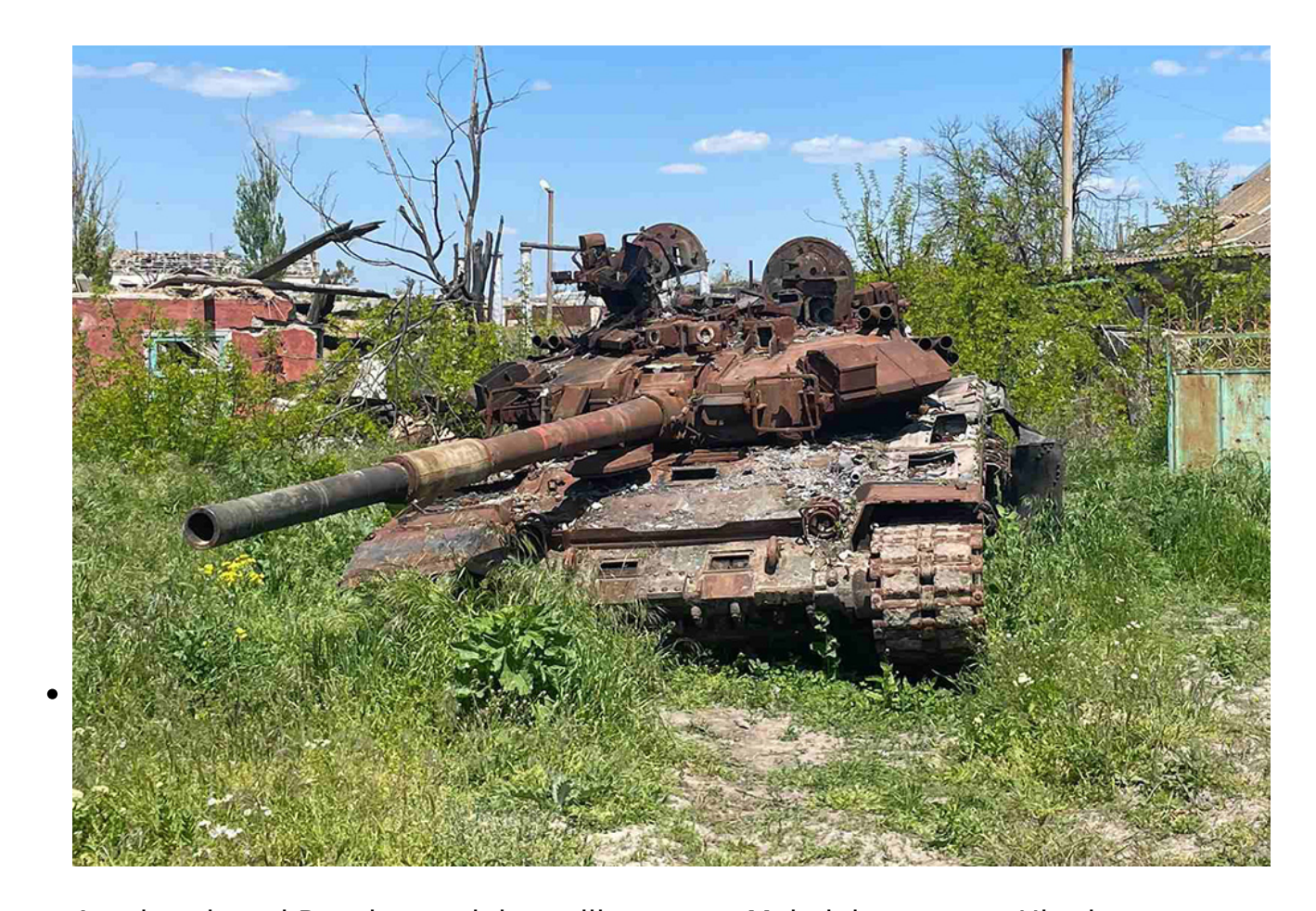
An abandoned Russian tank in a village near Mykolaiv, eastern Ukraine