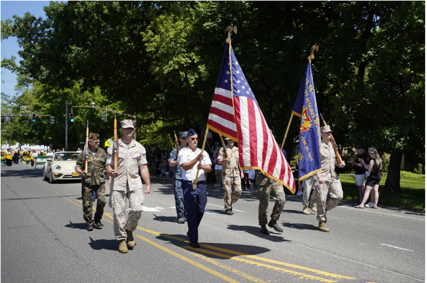
U.S. military veterans march in the annual Memorial Day parade in Setauket, New York, May 30, 2022.