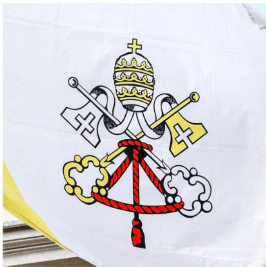
Vatican City flag at the Jesuit headquarters