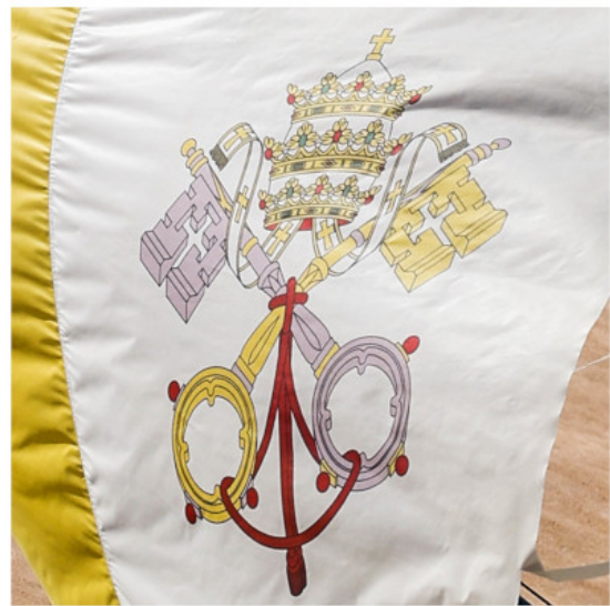
Vatican City flag at a Vatican-owned building

A variety of versions of the Vatican City flag are seen around Rome. Clockwise from the upper left, this graphic features the official version published in 2000 and again May 13, 2023; a version sold in a souvenir shop near the Vatican; the flag flying on the Jesuit headquarters; and the flag flying on a Vatican office building on Via della Conciliazione. Some of the images have been rotated to make comparisons easier.