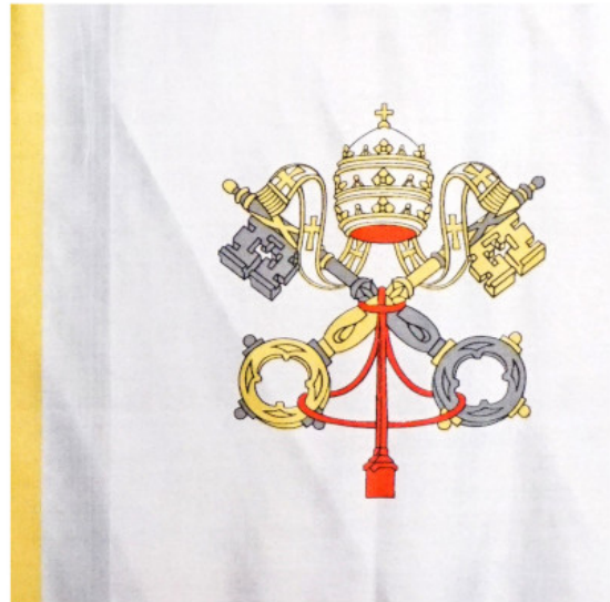
Vatican City flag at a souvenir shop