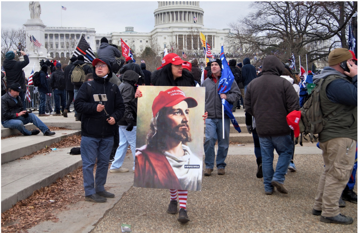
The image of a white Jesus is carried during the Jan. 6, 2021, insurrection at the Capitol.

Any version of Christianity that wittingly or unwittingly colludes with dominating and oppressive power betrays the very core of the Christian faith tradition: the cross. The cross symbolizes a faith tradition defined by speaking truth to, and resisting, unjust and subjugating power. The crucifixion was a sign of Jesus' opposition to such power. It indicated his commitment to a future where the sacred dignity and personhood of every single human being is valued and respected, without exception.