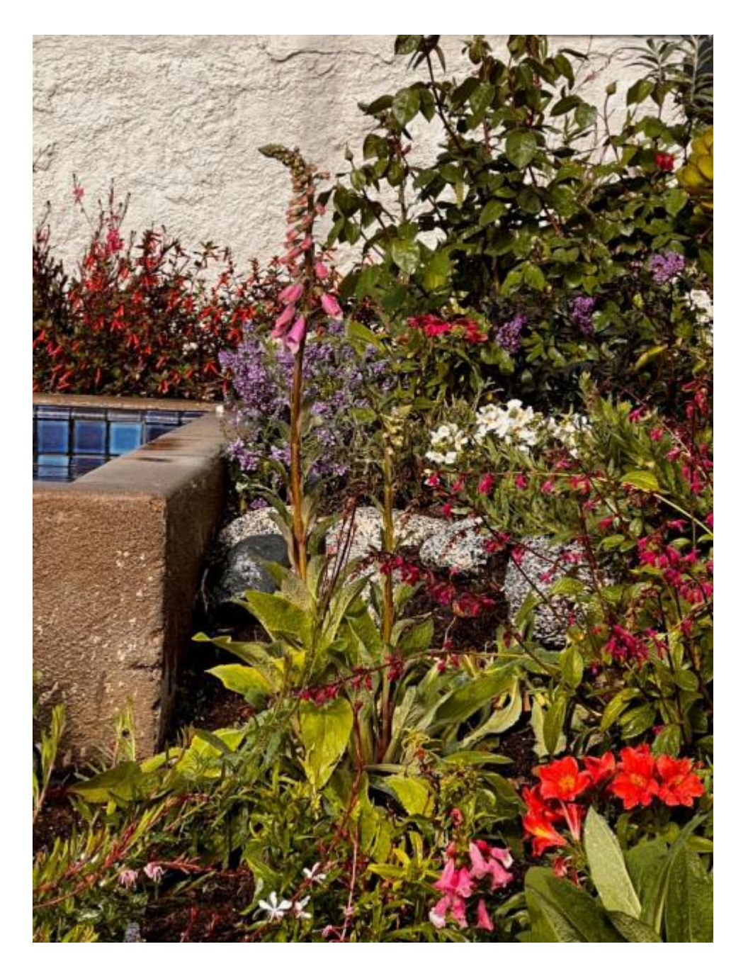
St. Mary's Episcopal Church in Laguna Beach, California, installed a drip irrigation system and began planting native plants in 2014. In 2022, the gardens transitioned to all native California plants.