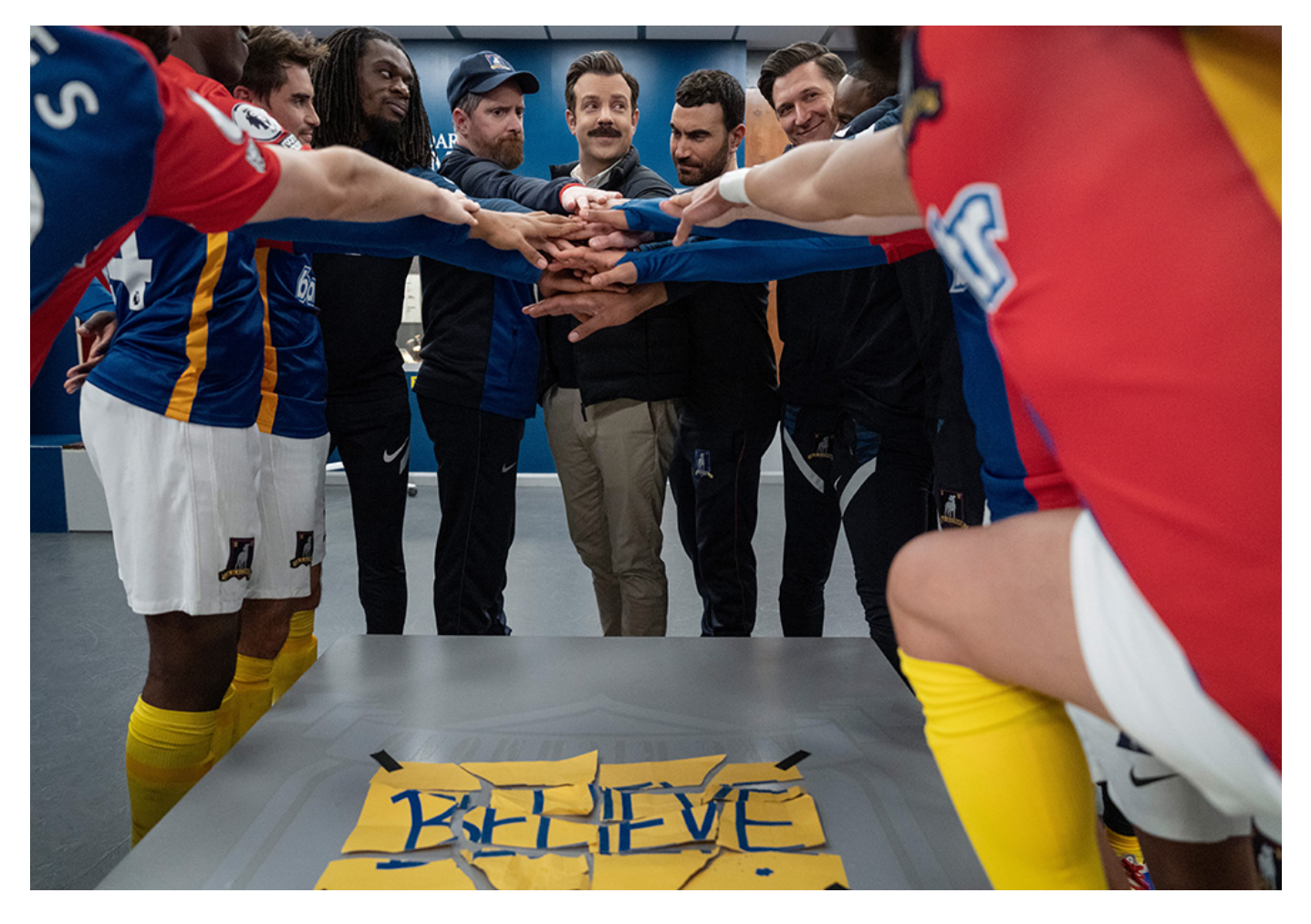
A scene from the series finale of "Ted Lasso"

Not long ago, I received a message from a reader who, apparently after I had positively reviewed the show, decided to watch the program but objected to the frequent use of curse words by some of the characters and felt that it was unbecoming of a Catholic priest and theologian to "promote" such a show.