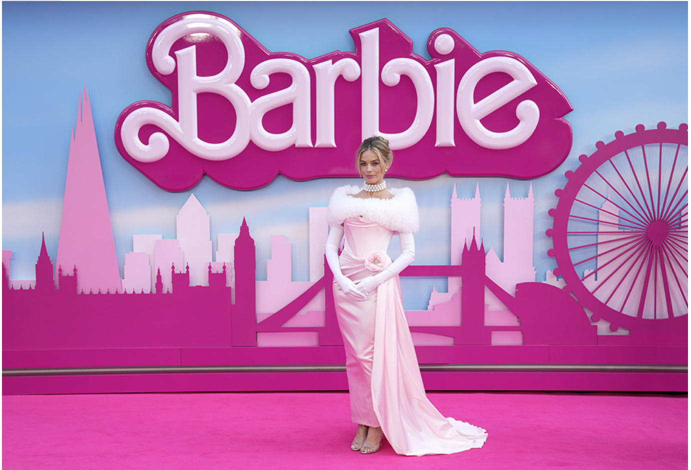
Margot Robbie poses for photographers upon arrival at the premiere of the film "Barbie" in London July 12.