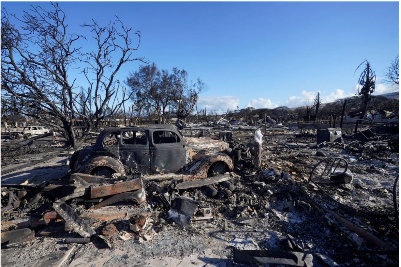
Wildfire damage is shown, Saturday, Aug. 12, 2023, in Lahaina, Hawaii.