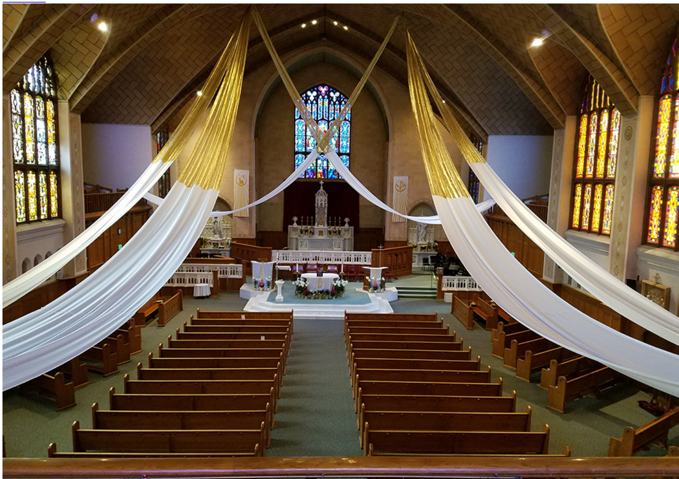
St. Ignatius of Loyola Parish's sanctuary, decorated for Easter