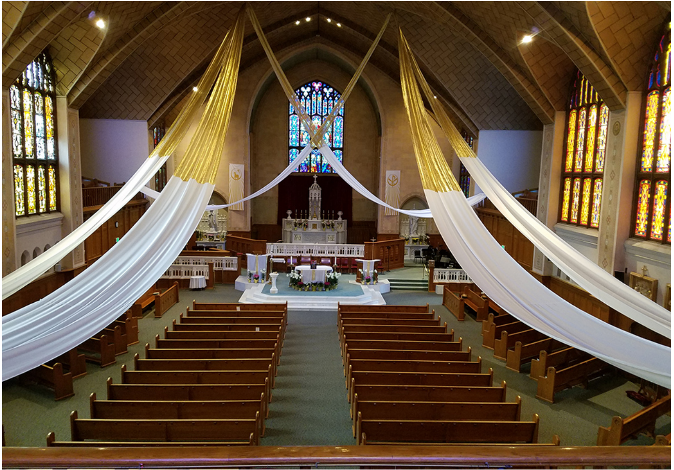
St. Ignatius of Loyola Parish's sanctuary, decorated for Easter