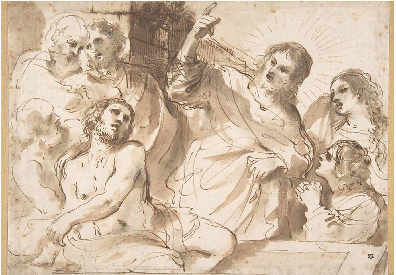
"The Raising of Lazarus," circa 1619 by Guercino (Giovanni Francesco Barbieri) (Metropolitan Museum of Art)