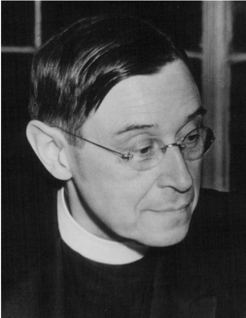
Jesuit Fr. John LaFarge