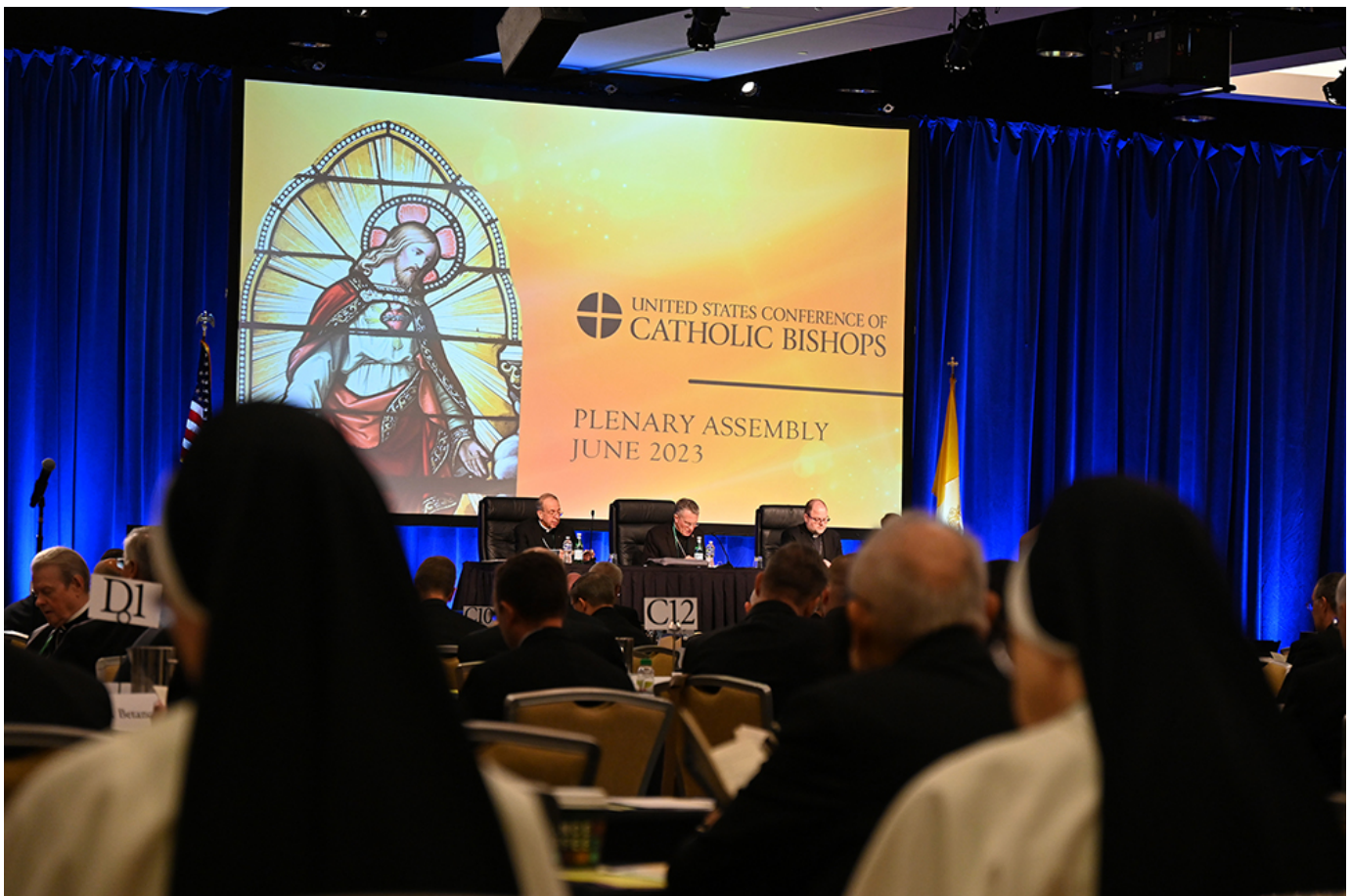
Two nuns, foreground, attend the U.S. Conference of Catholic Bishops meeting in Orlando, Florida, June 15.