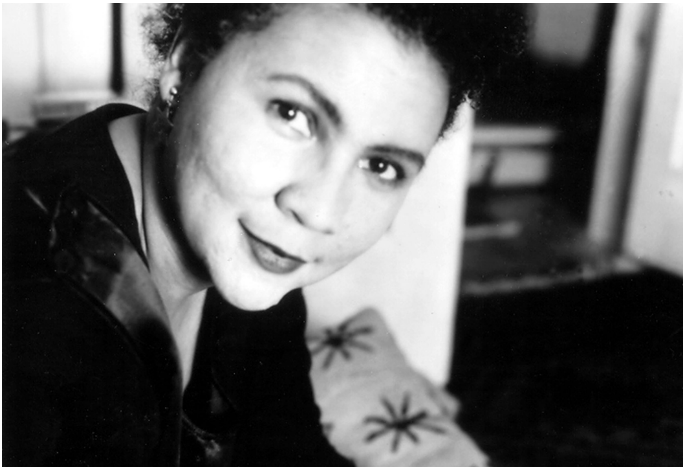
Author and social activist bell hooks