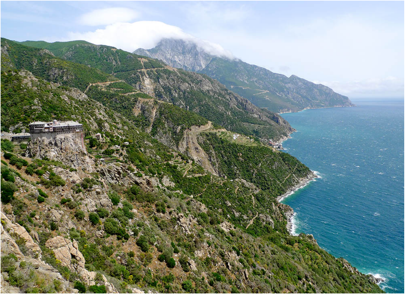
The Monastery of Simonos Petra is seen on Mount Athos in Greece.

The problem throughout this book, and I suspect most books about integralism suffer from the same problem, is that it is a sane analysis of madness. You make the same kind of marginal notes you do in other books — "strong argument," "good point," and "is this true?" — but then you put it down and wonder if you are still on planet Earth.