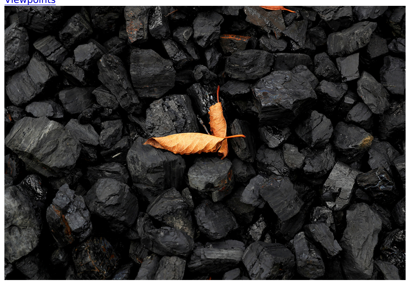
A leaf sits on top of a pile of coal in this illustration photo.