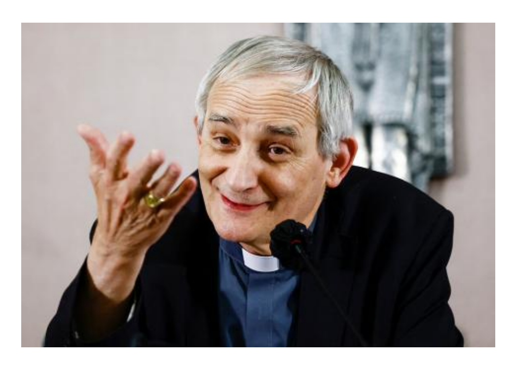
Cardinal Matteo Zuppi is pictured in a May 27, 2022, photo.

Meanwhile, the fate of deported children has also been raised repeatedly by the Vatican's ambassador to Ukraine, Archbishop Visvaldas Kulbokas, one of very few foreign representatives remaining in Kyiv throughout the war.