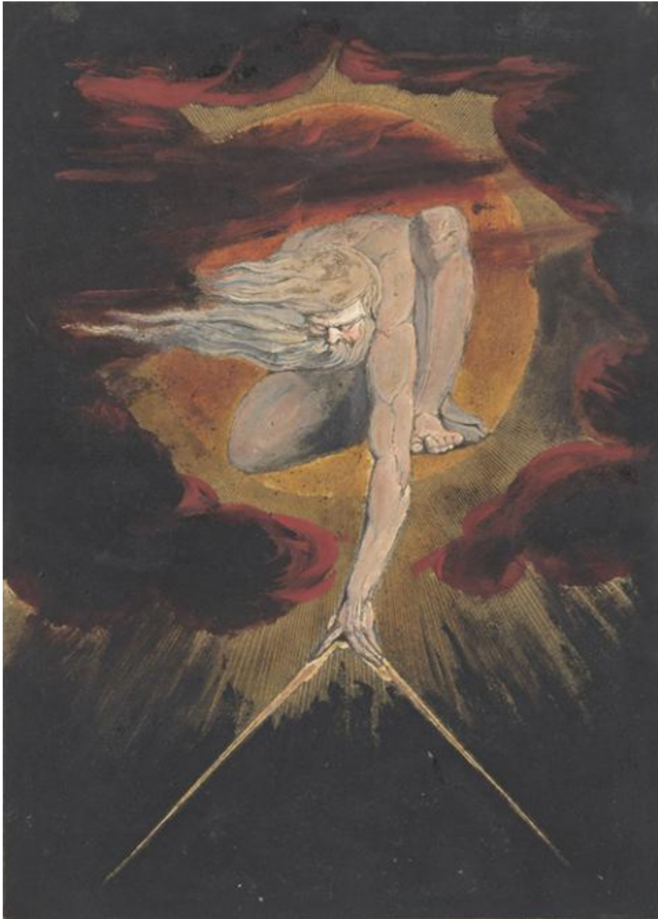
"The Ancient of Days," from "Europe a Prophecy," printed 1795, William Blake (British, 1757-1827), color-printed relief etching in dark brown with pen and black ink, oil, and watercolor

It was worth the wait. I've seen some of the works before, including at the Tate, but it was inspiring to see so many Blake works exhibited together.