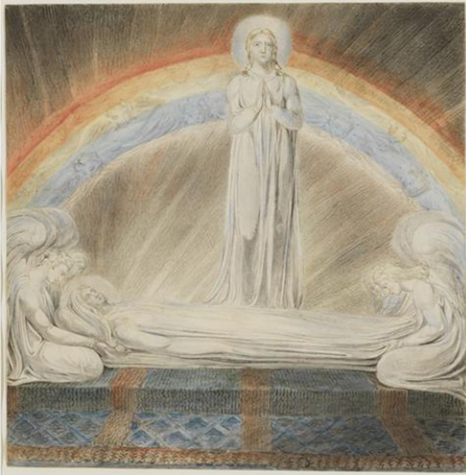
"The Death of the Virgin," 1803, William Blake (British, 1757–1827), watercolor

I find that a bit sad — no one can question Blake's talent and versatility in printmaking, tempera and watercolor, but imagine what he could have done had he embraced oil painting — and on the scale Turner so masterfully pulled off.