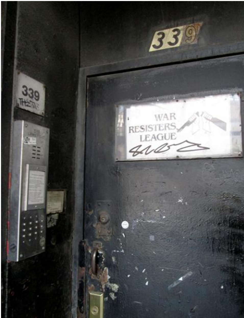
The front door of the building known as the "Peace Pentagon" is seen in 2016.