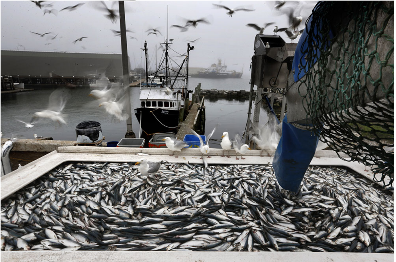
Herring are unloaded from a fishing boat in Rockland, Maine, July 8, 2015.