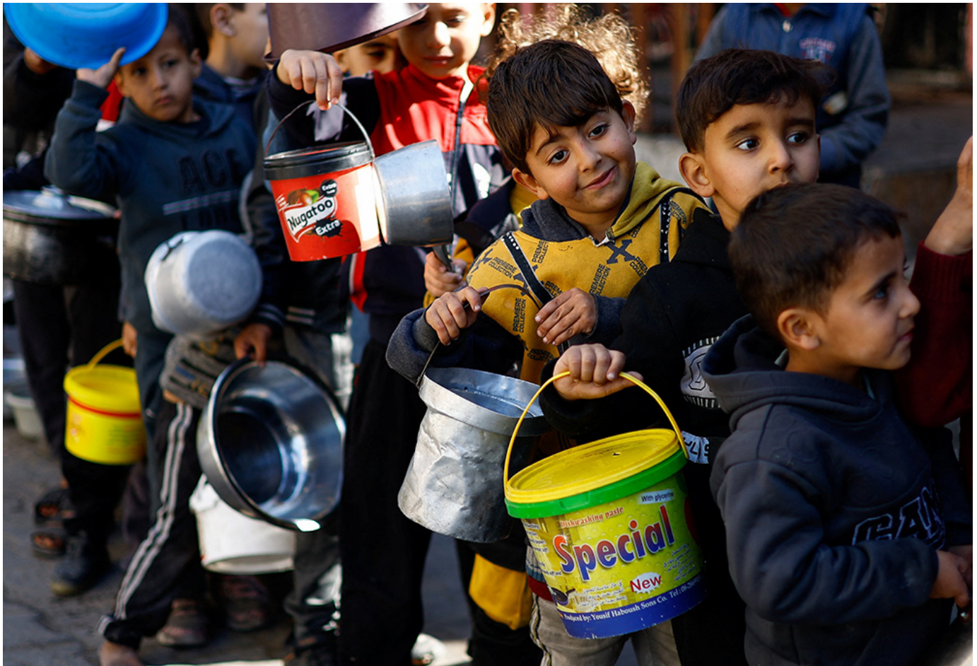
Displaced Palestinian children wait to receive food at a distribution center in Rafah in the southern Gaza Strip Jan. 16, amid the ongoing conflict between Israel and the Palestinian Islamist group Hamas.

No matter who the perpetrator is, the sin and crime of military intervention, occupation, abduction, indiscriminate killing, the use of weapons of mass murder, displacement, ethnic cleansing and genocide must be condemned unreservedly. Those who are denied the status of persons, who are tortured, bombed and crushed under the rubble, cry out for peace, accountability and just reparations. Instead of heeding these cries and advocating for total demilitarization, the U.S. government — which vetoed a U.N. ceasefire resolution in the Israel-Hamas war — is the world's leading arms dealer; it proceeds with an over $1 trillion, several decadeslong nuclear modernization program while refusing (with other nuclear nations) to ratify the Treaty on the Prohibition of Nuclear Weapons, and will spend $886 billion on the 2024 military budget.