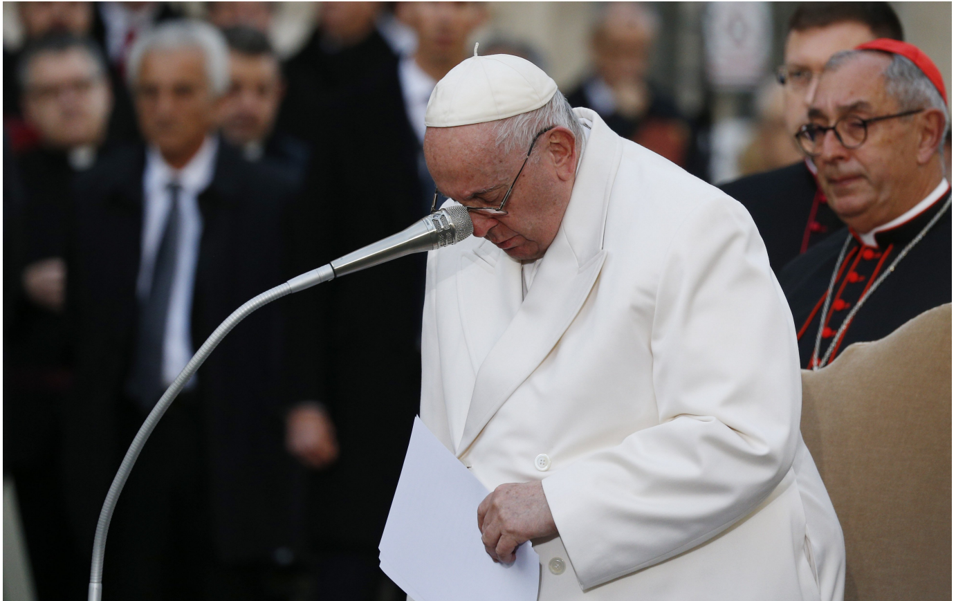
Pope Francis cries as he prays for Ukraine in front of a Marian statue at the Spanish Steps in Rome Dec. 8, 2022, the feast of the Immaculate Conception.

anniversary of the U.S. nuclear atrocities against Japan; being arrested with him at the Pentagon, White House, and for protesting the Trident submarine; and offering support when he was tried and jailed for the Pax Christi-Spirit of Life plowshares action. I've observed campaigns he organized in New Mexico calling on Los Alamos and Sandia national nuclear labs to stop developing nuclear weapons, as well as his organizing efforts with Campaign Nonviolence.