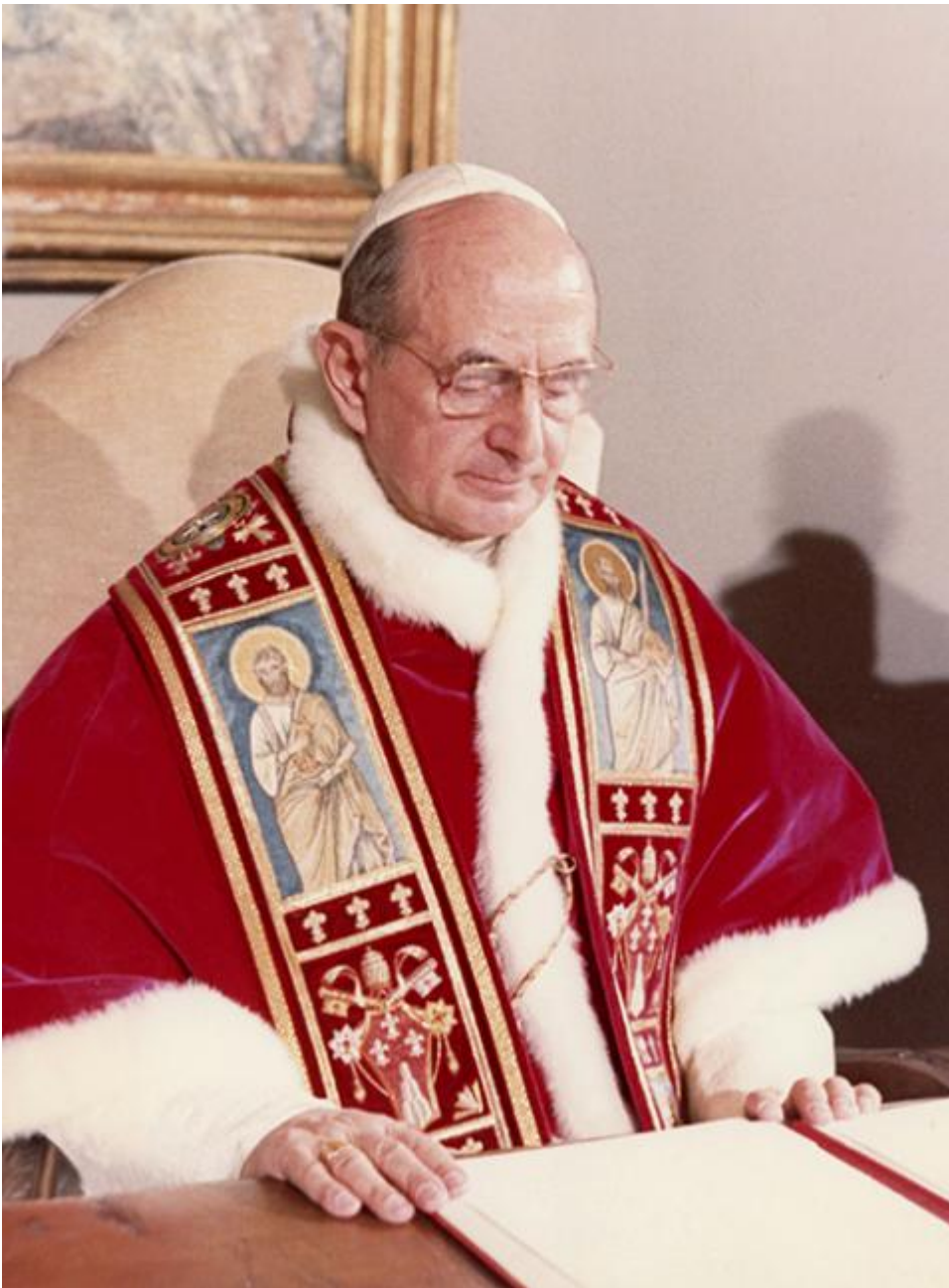
Pope Paul VI at the Vatican on June 29, 1968

Despite romantic fantasies about a better, nobler past, for most of history there was no expectation that men would treat women with basic respect, let alone "reverence." In the Hebrew Scriptures and the Homeric epics, men renowned for honor and heroism casually treat women as objects to be used and discarded. The practice of polygamy, widespread in many cultures in the past, allowed men to utilize women as toys for pleasure or tools for breeding.