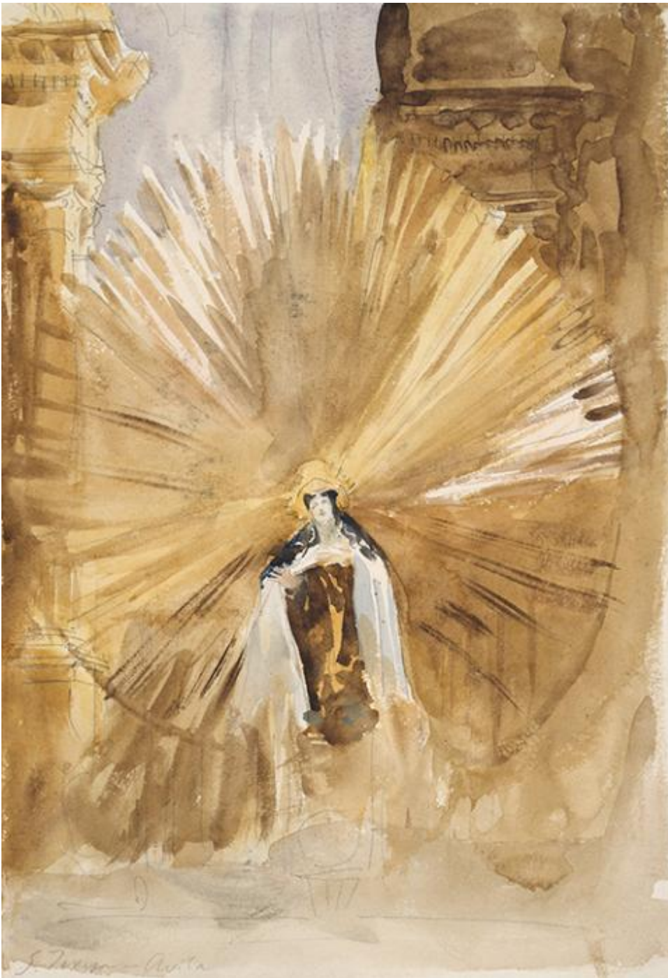
St. Teresa of Ávila in a circa-1903 watercolor by John Singer Sargent