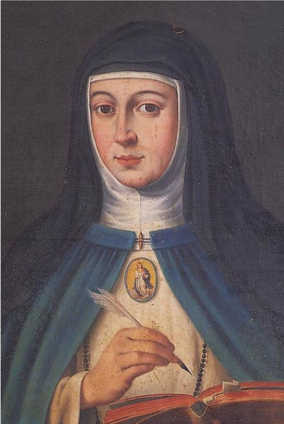
Detail of an undated portrait of Sor María de Ágreda

Masseo was a witness, but also a participant. Shortly after Francis ordered him to yield, Masseo obediently fell into his arms and was soon set aloft by the power of the saint's own breath.