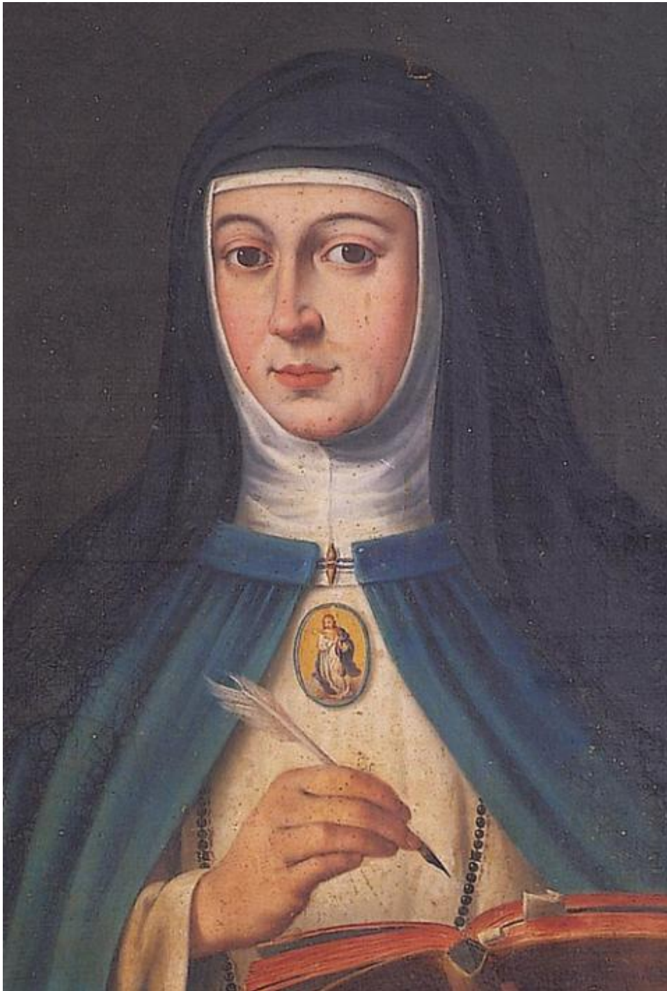
Detail of an undated portrait of Sor María de Ágreda

Masseo was a witness, but also a participant. Shortly after Francis ordered him to yield, Masseo obediently fell into his arms and was soon set aloft by the power of the saint's own breath.