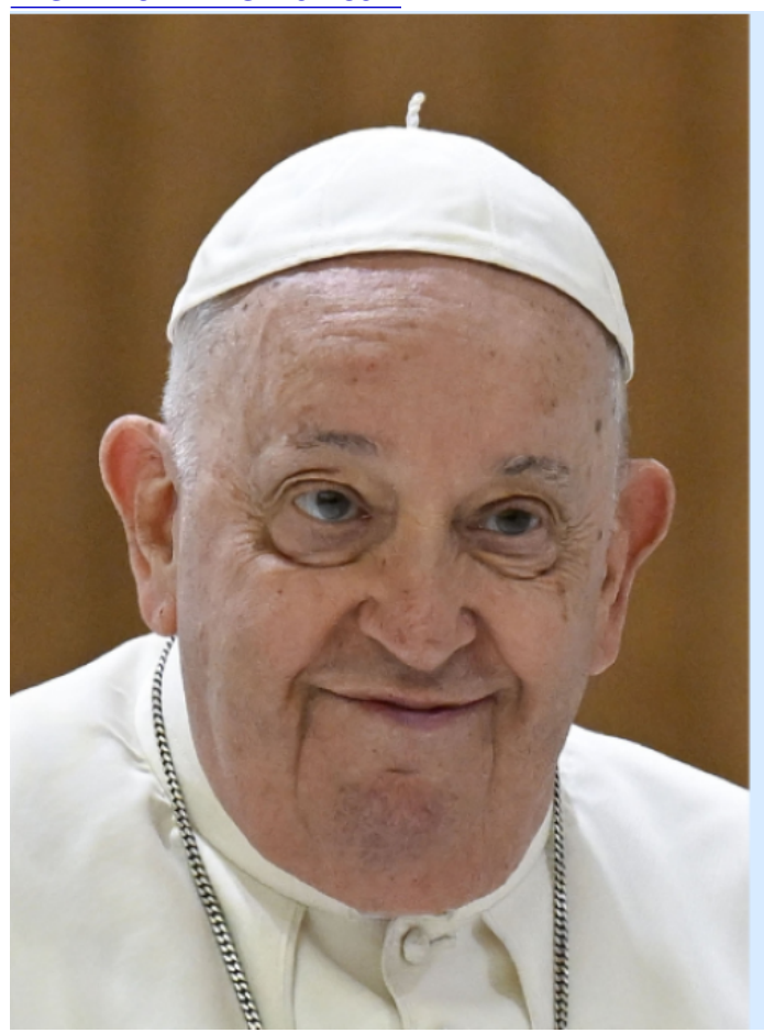
<u>Vatican</u> View from the Vatican