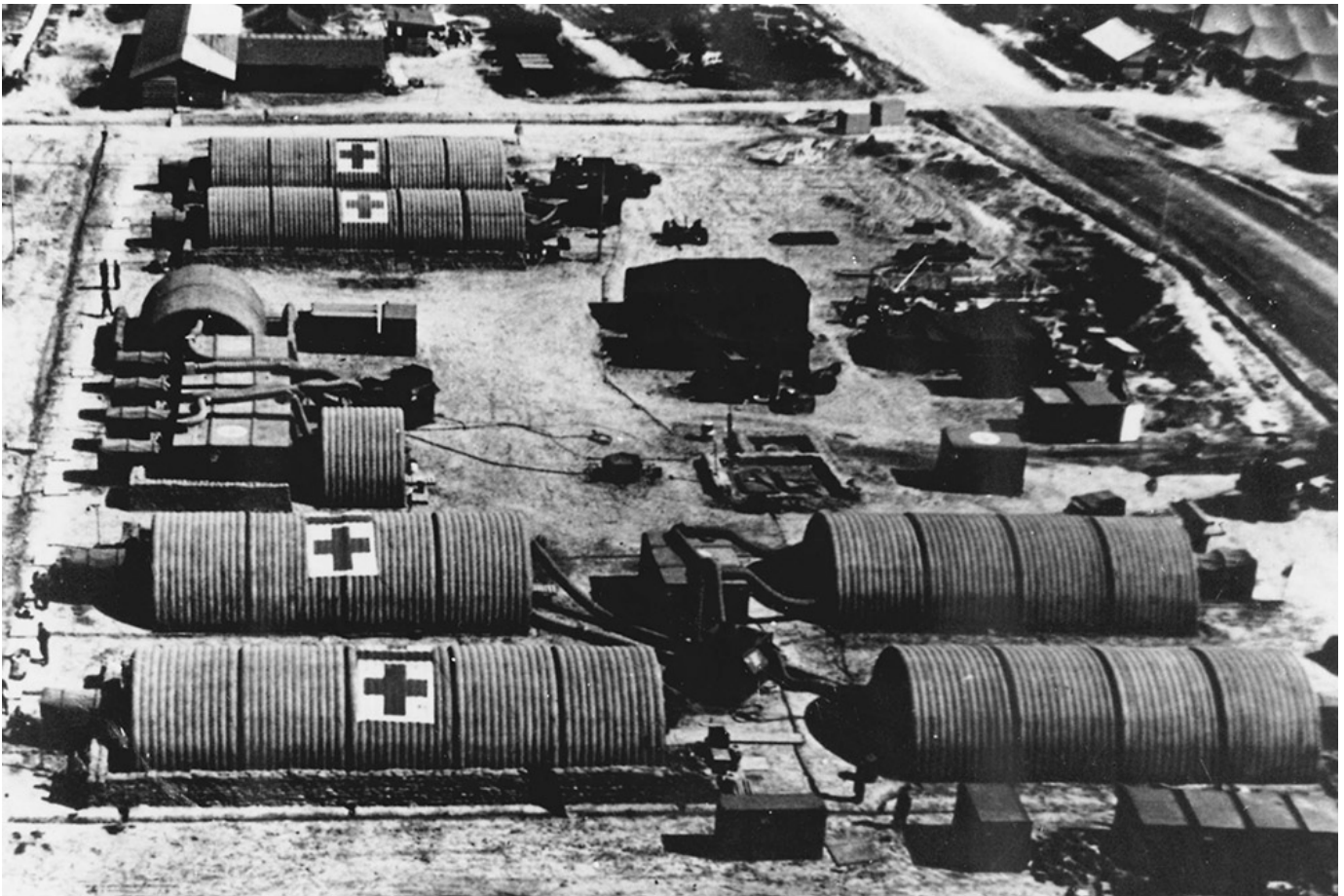
Medical Unit Self-Contained Transportable (MUST) at Fort Sam Houston in Texas, circa 1968