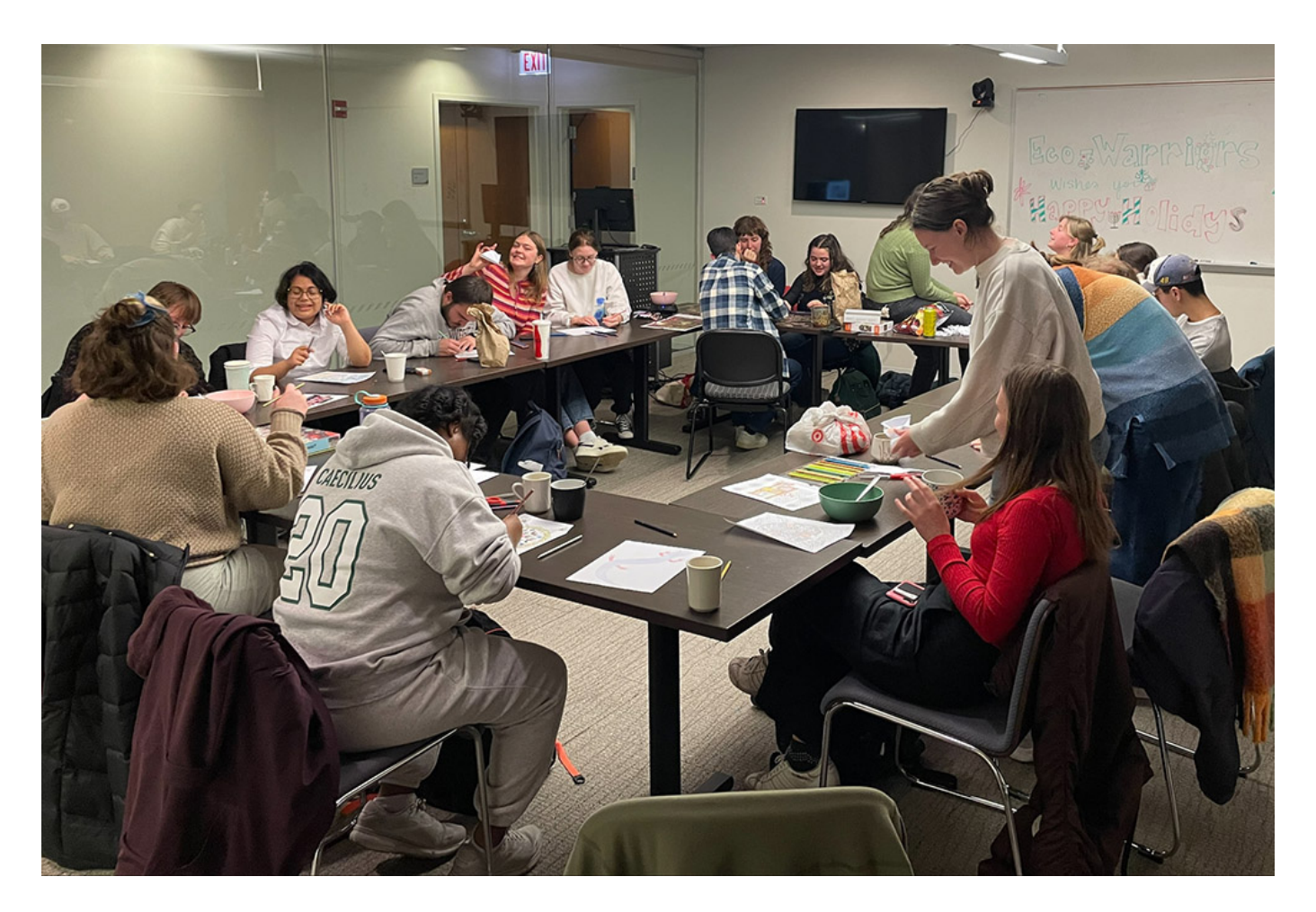
The "Eco-Warriors" group meets at Loyola University Chicago.

While young people are resilient, their anxiety around climate issues can be subtle, and those who work with them — teachers, school counselors, campus ministers — should be educated and attuned to it, say those involved in programs to address climate anxiety. The antidotes, they say, include environmental activism, community support and spiritual sustenance.